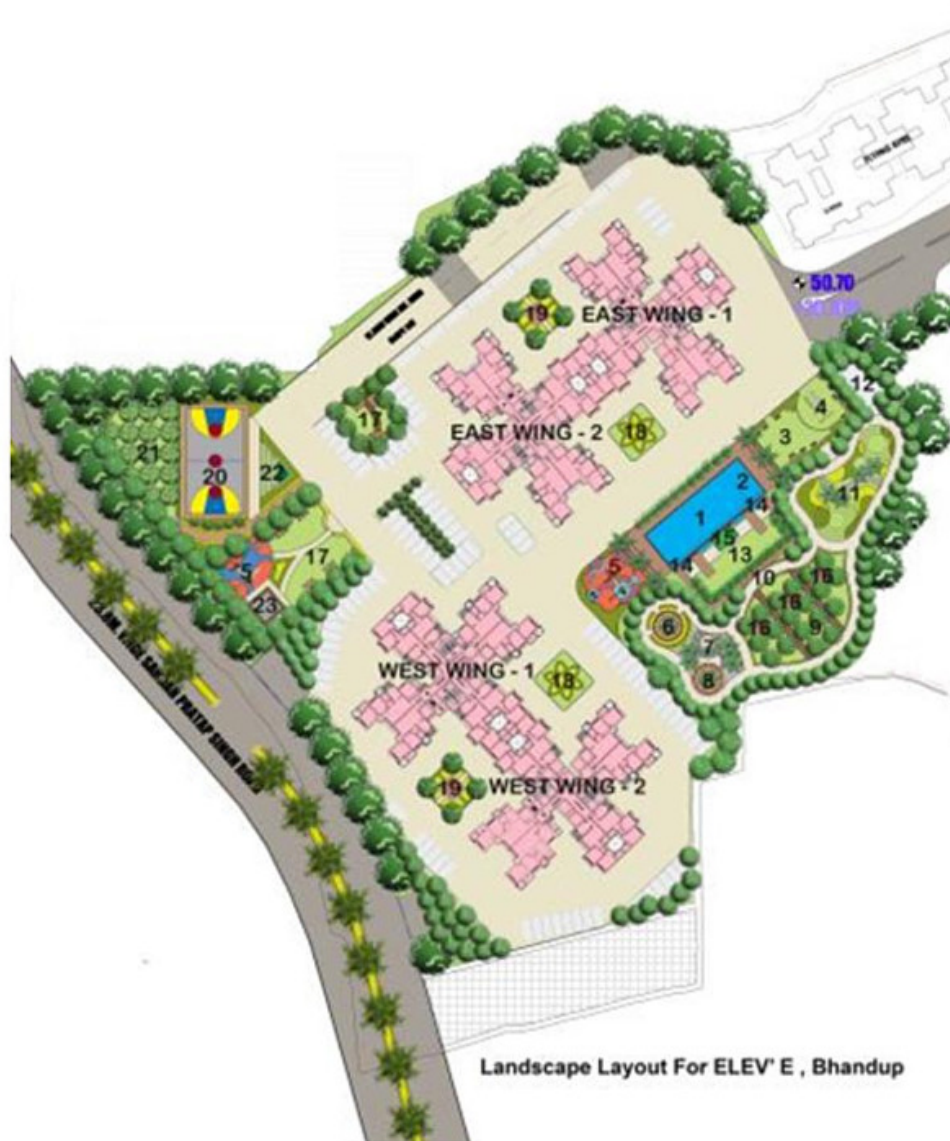
Landscape Layout For ELEV' E , Bhandup