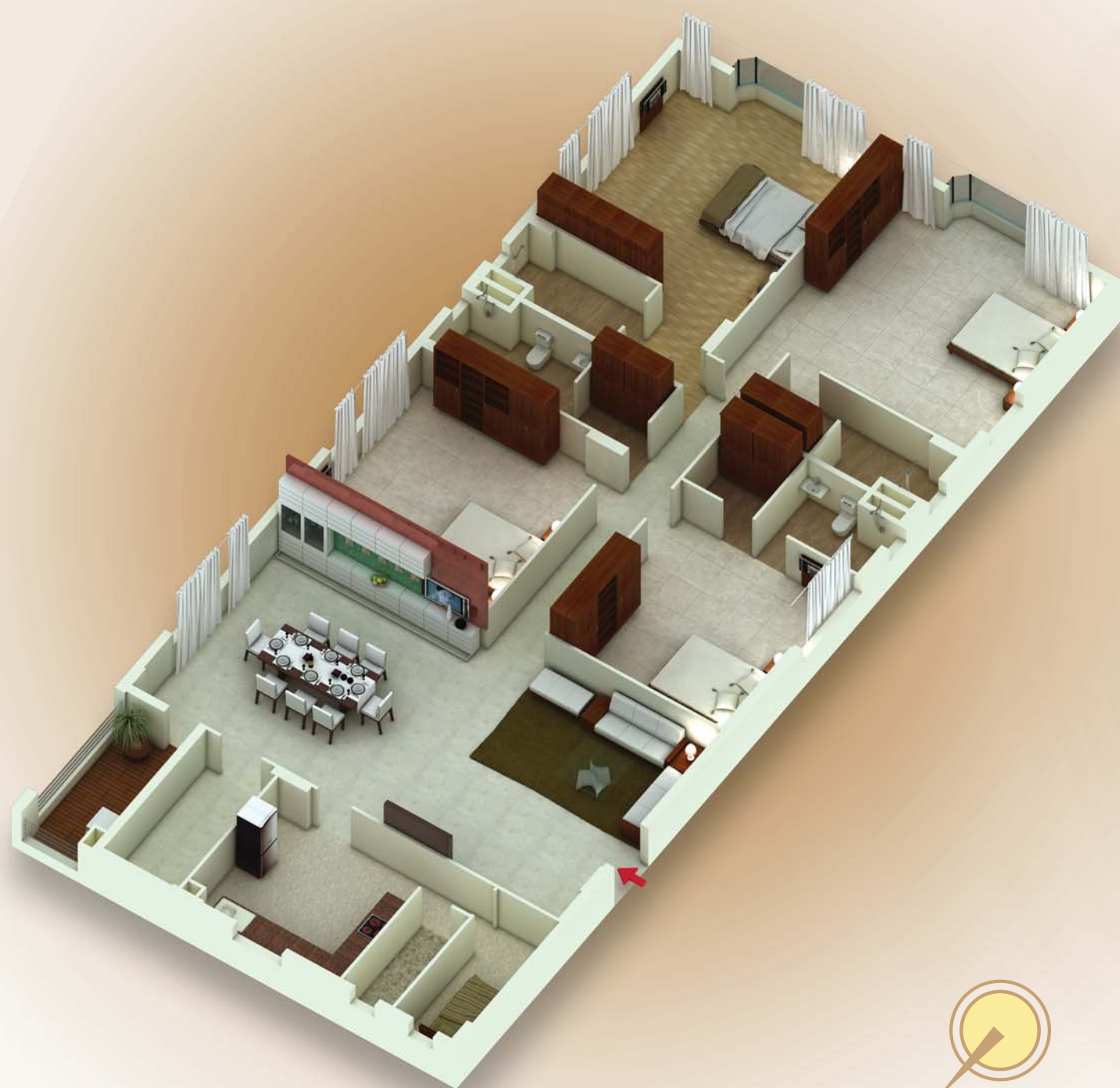
FLAT - 01 / 3760 sq ft