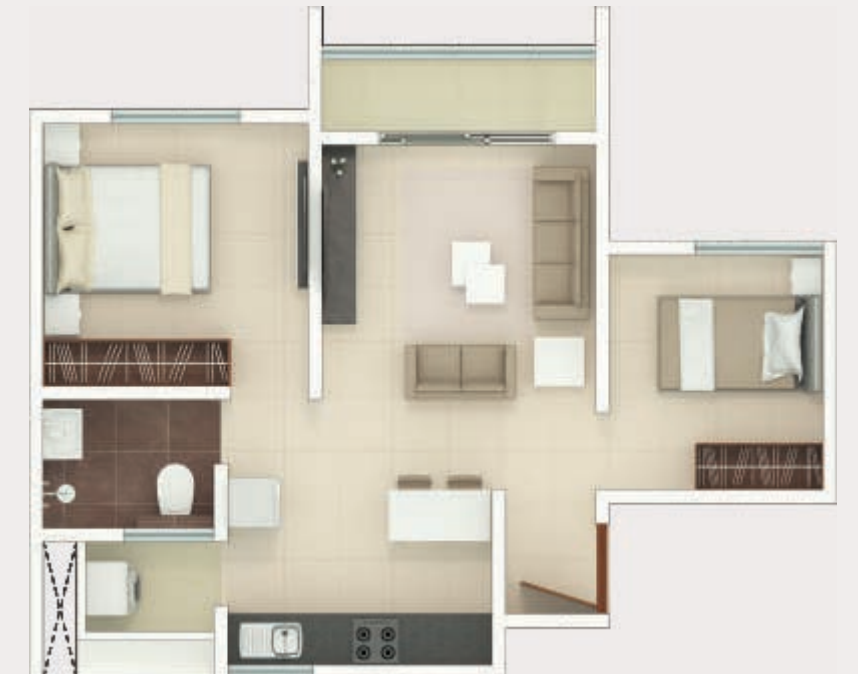
Typical 1.5 BHK Carpet Area 470 - 480 sqft