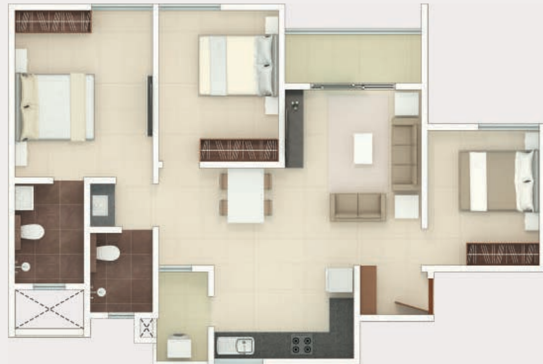
Typical 2.5 BHK Carpet Area 850 - 900 sqft