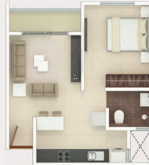
Typical 1 BHK Carpet Area 390 - 430 sqft