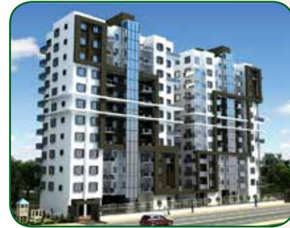
Rajwada Heights ▶▶ EM Bypass Extention, Narendrapur