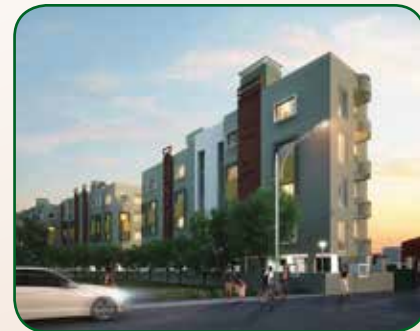
Rajwada Estate ▶▶ Mahamayatala, Garia, N.S.C. Bose Road