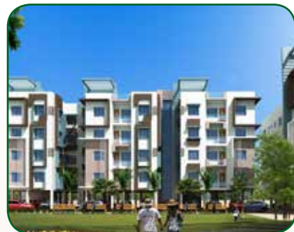
◀ Rajwada Roeswood Near extended EM Bypass, Narendrapur