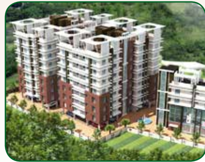
◀ Rajwada Grand Kamalgazi More, NSC Bose Road