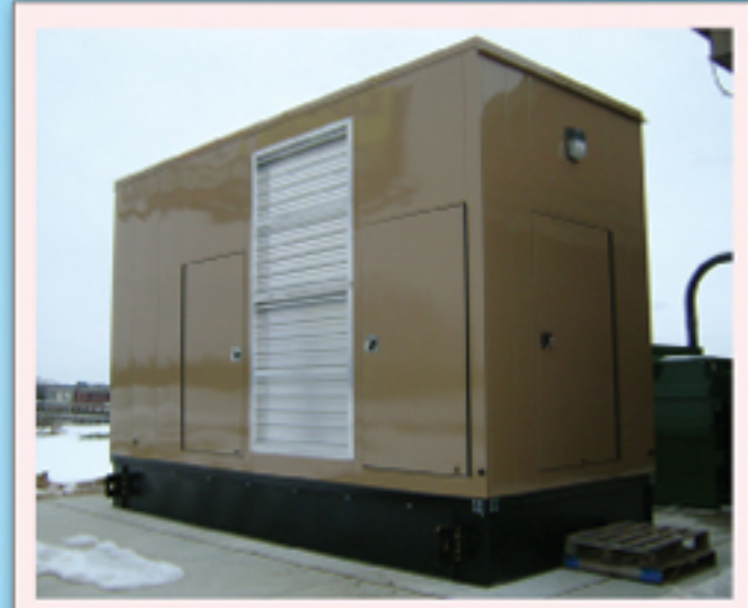
24x7 Hr Power Backup