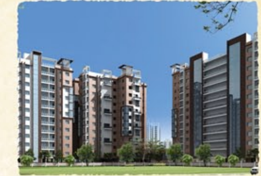
Narendrapur, Elachi, Extended E.M. Bypass