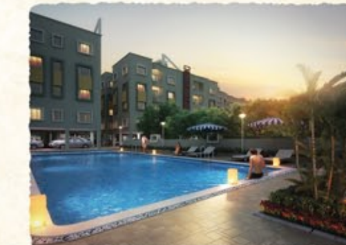
Garia, N.S.C Bose Road