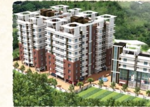
KamalgaZI More, N.S.C Bose Road