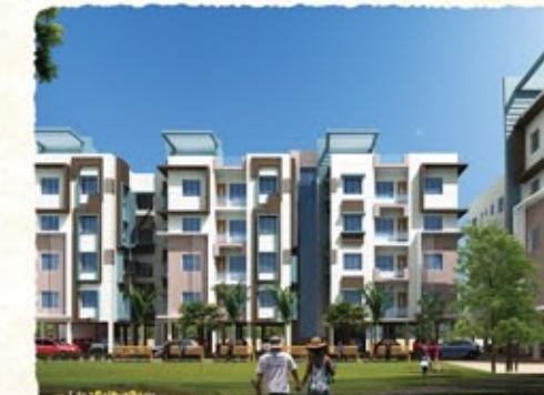
Narendrapur, Jagaddal, Near Extended E.M. Bypass