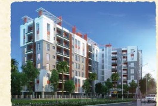
Narendrapur, N.S.C Bose Road