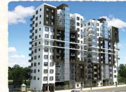
Narendrapur, Elachi, Extended E.M. Bypass