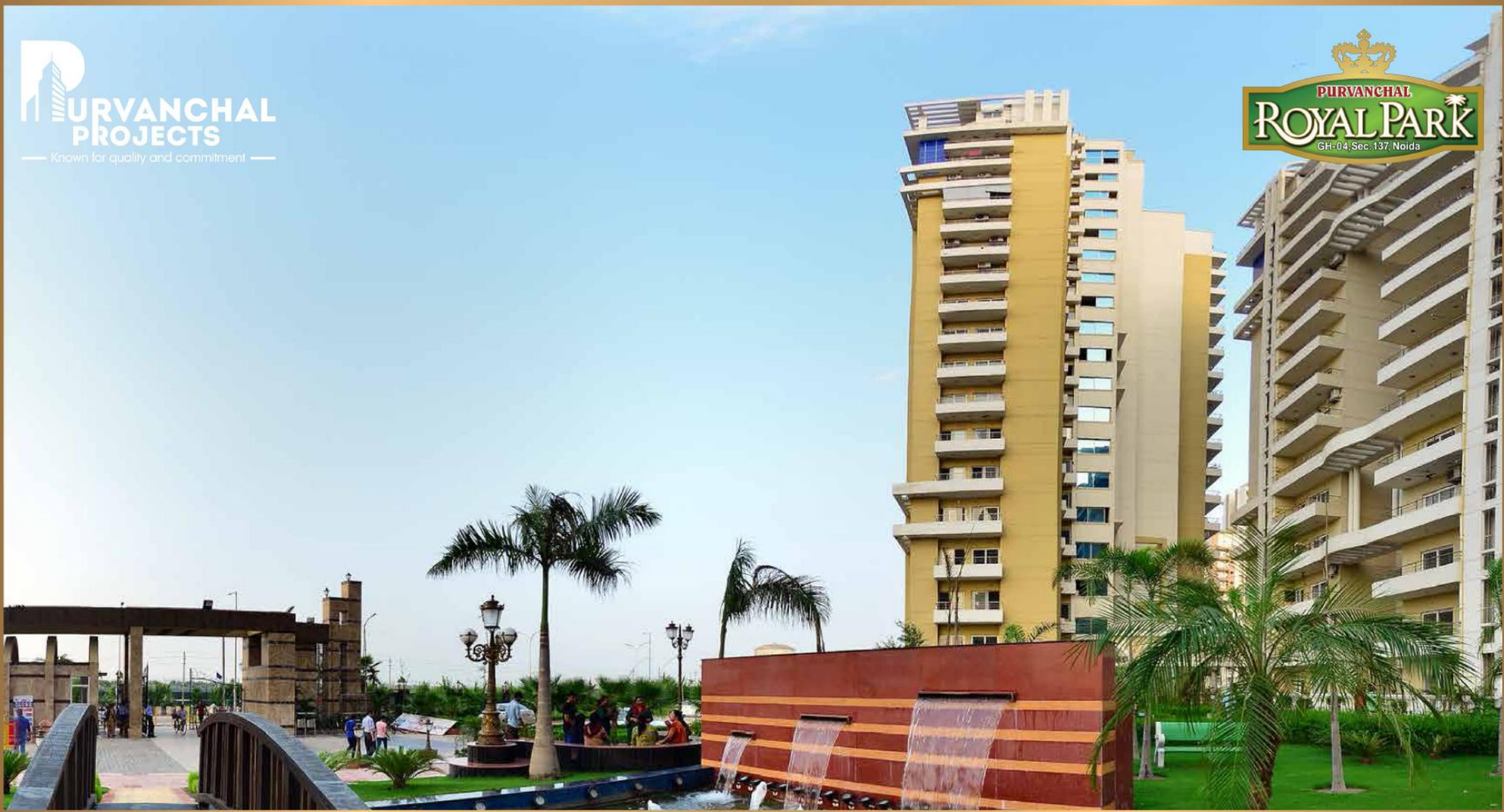
ACTUAL IMAGE SHOT ON SITE