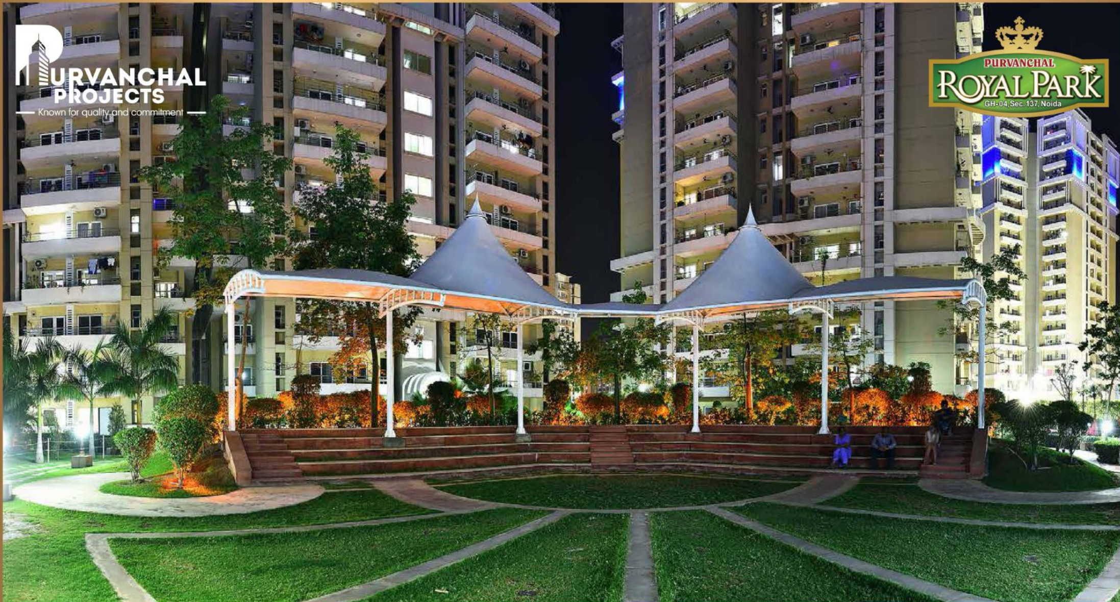
ACTUAL IMAGE SHOT ON SITE