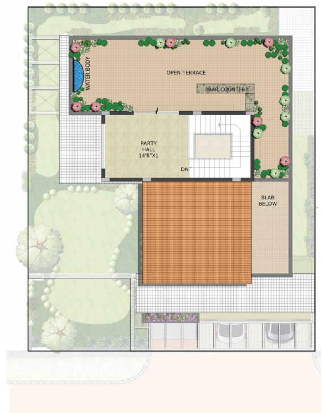
Each semi-detached villa of type A,B, C and D are combination of 2 units, comprising of the staff room and the villa itself

Furniture fixtures or fittings shown in the floor plan are not standard and will not be provided in the apartment. Areas mentioned herein are approximate and shall vary based on selected apartment. Common areas/lobbies and window placement may vary based on selected floor. All plans are in accordance with the latest approved sanctioned plan and are subject to changes mandated by government authorities and /or applicable laws from time to time