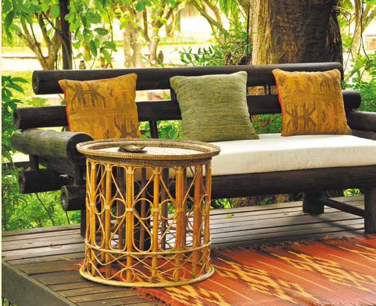
Senior Citizens' Area