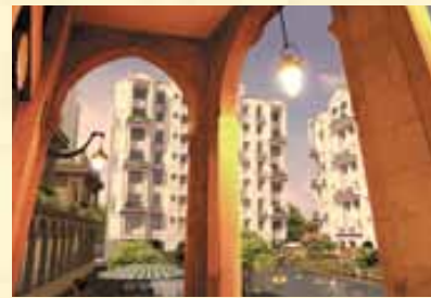
PURANIKS Aldea Espanola