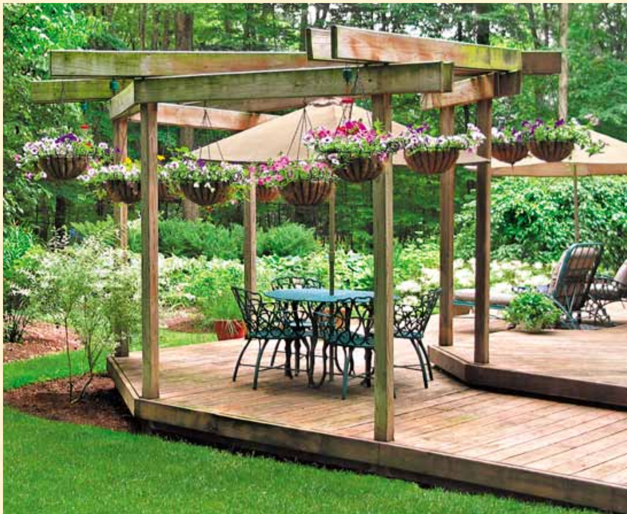
Chit Chat Corner