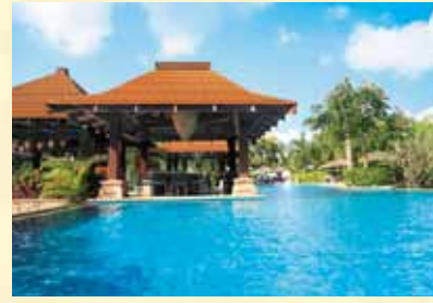
PURANIKS Rumah Bali