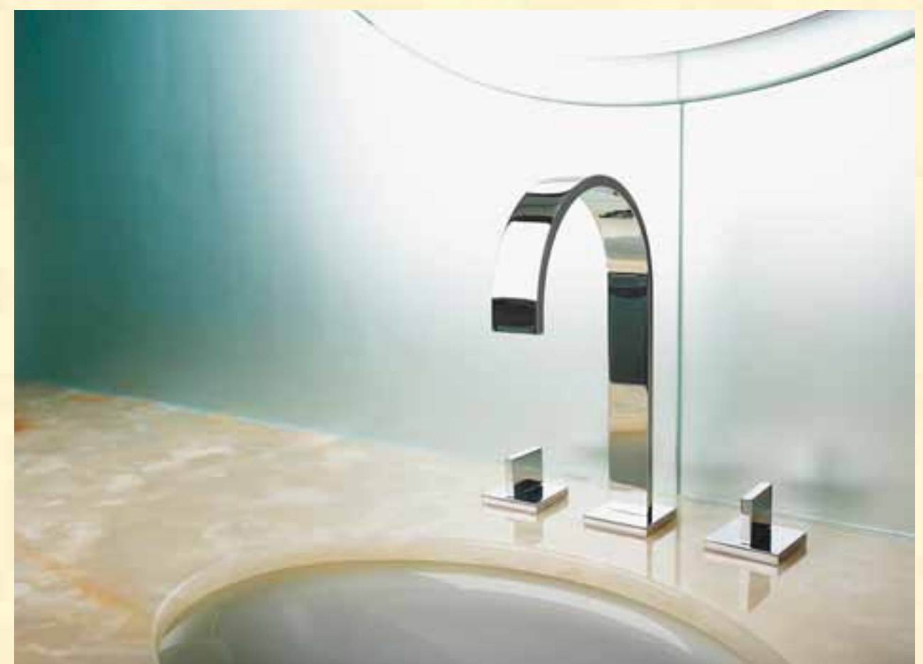
Kohler Fittings or equivalent