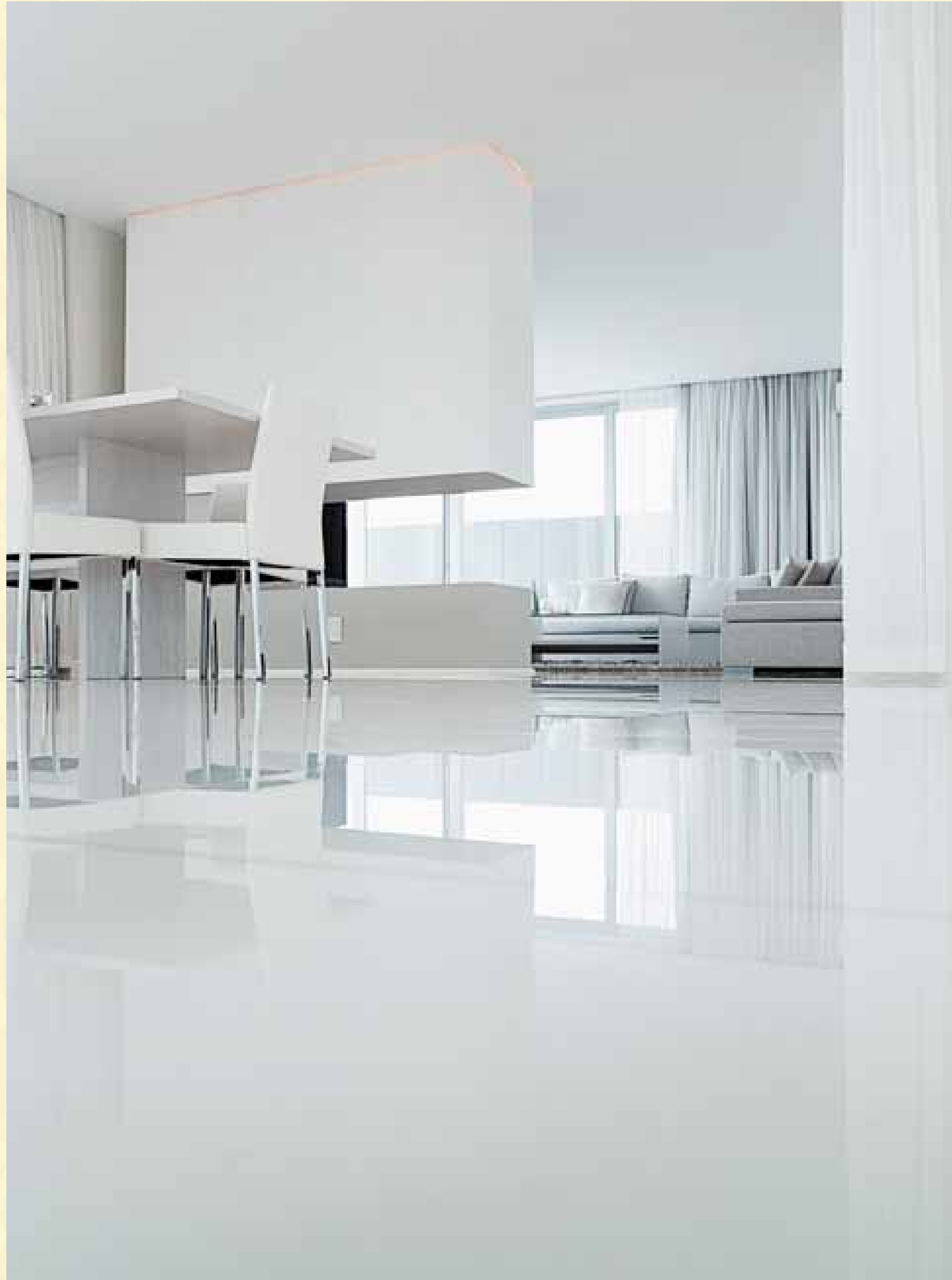
Branded Vitrified tile flooring in all rooms