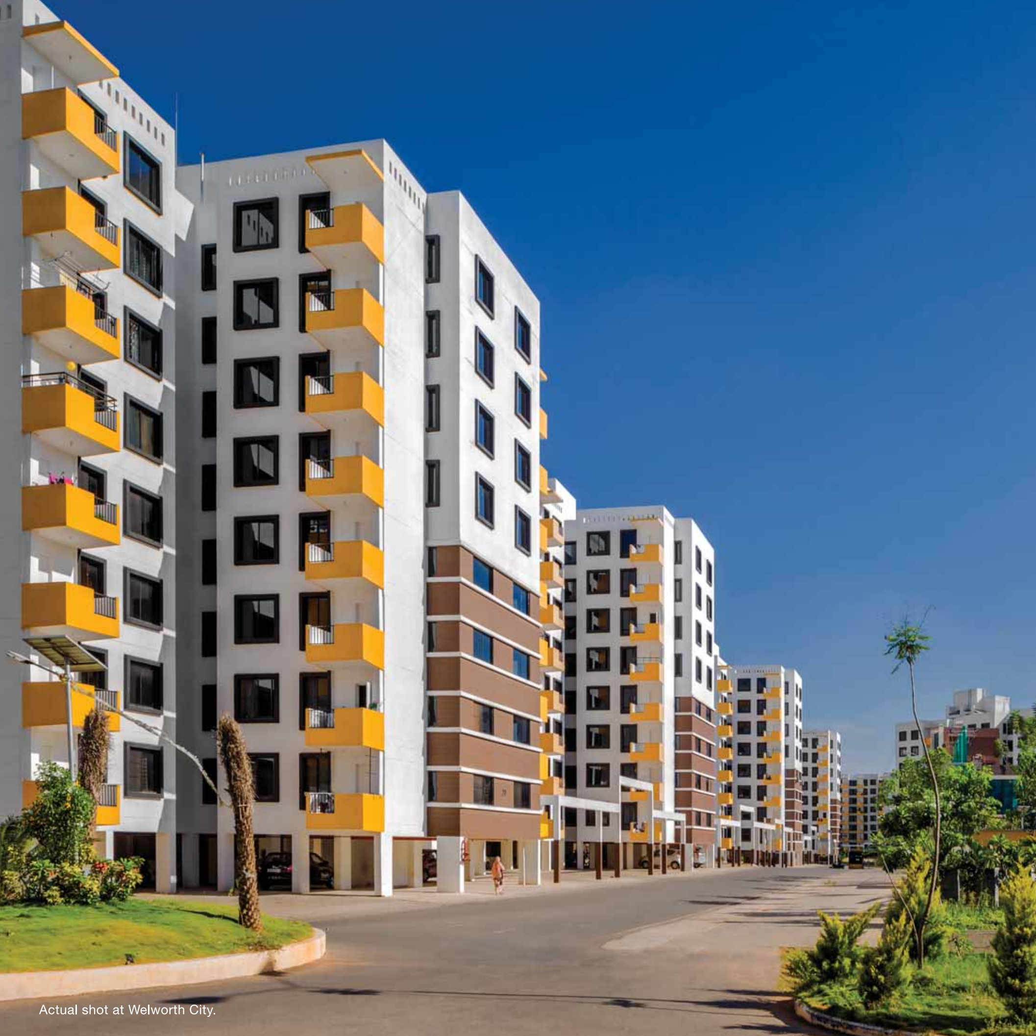
Actual shot at Welworth City.