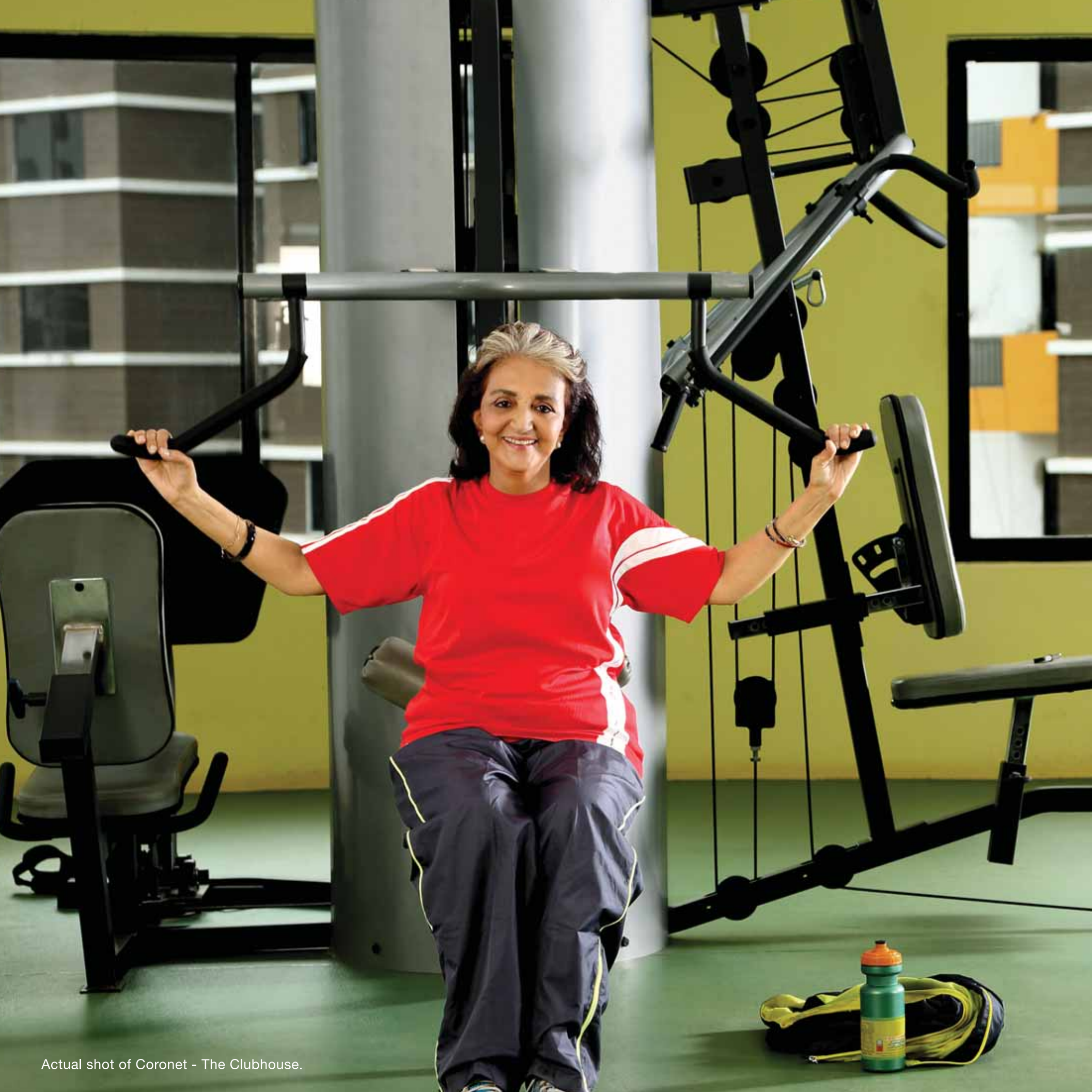
Actual shot of Coronet - The Clubhouse.