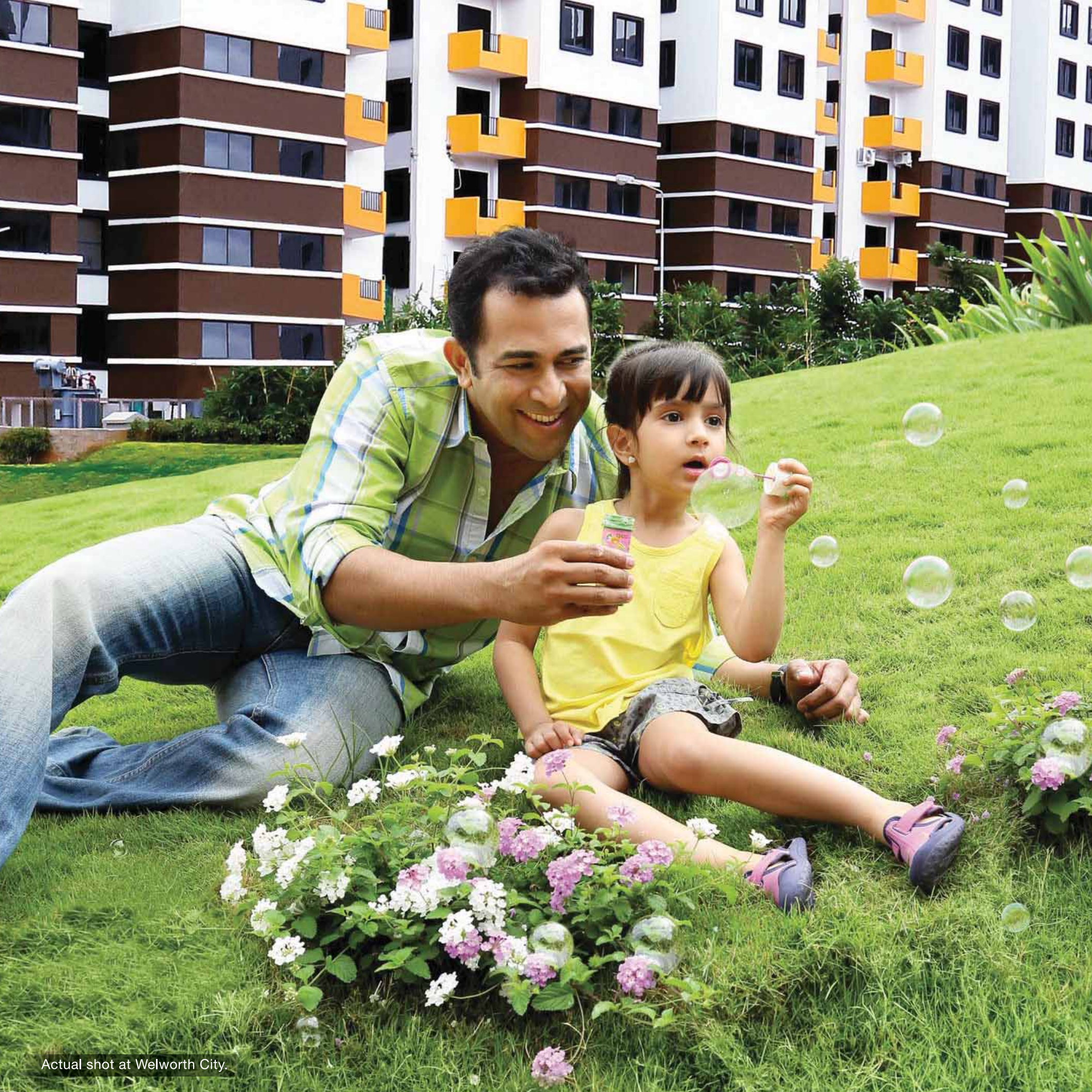
Actual shot at Welworth City.