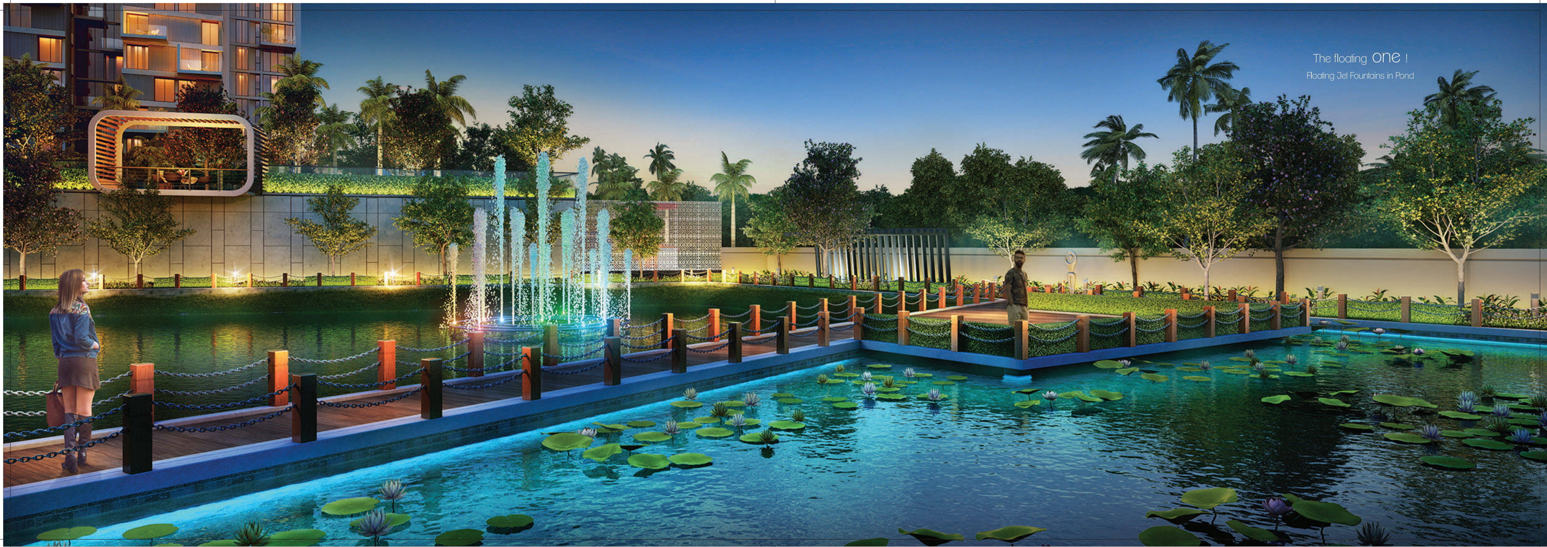
The floating one | Floating Jet Fountains in Pond