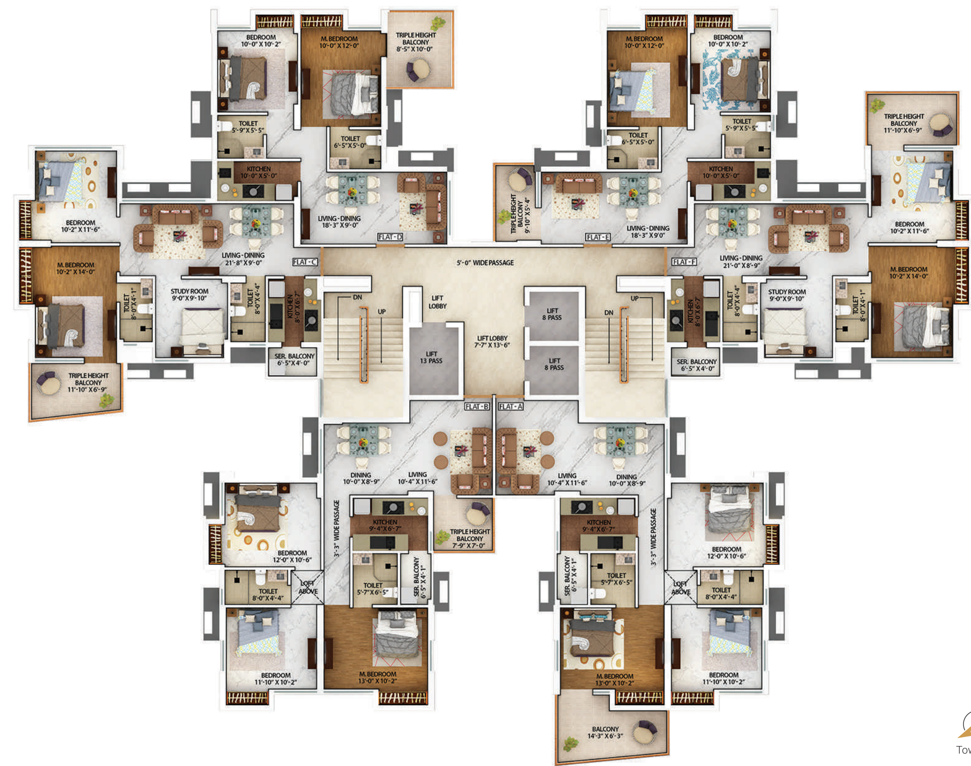
Tower 1 & 3 - 2, 5, 8, 11, 14 & 17th floor plan