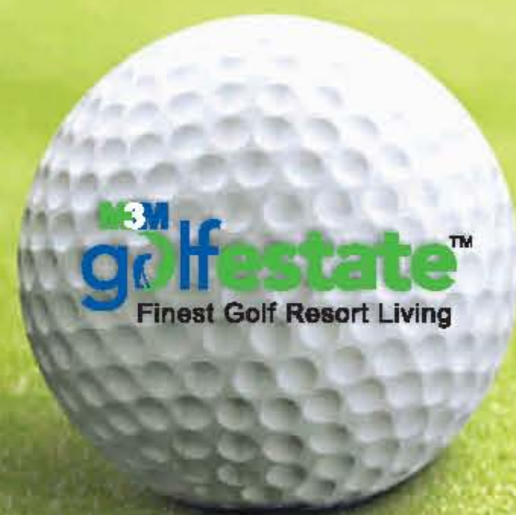
CLASSIC GOLF COURSE