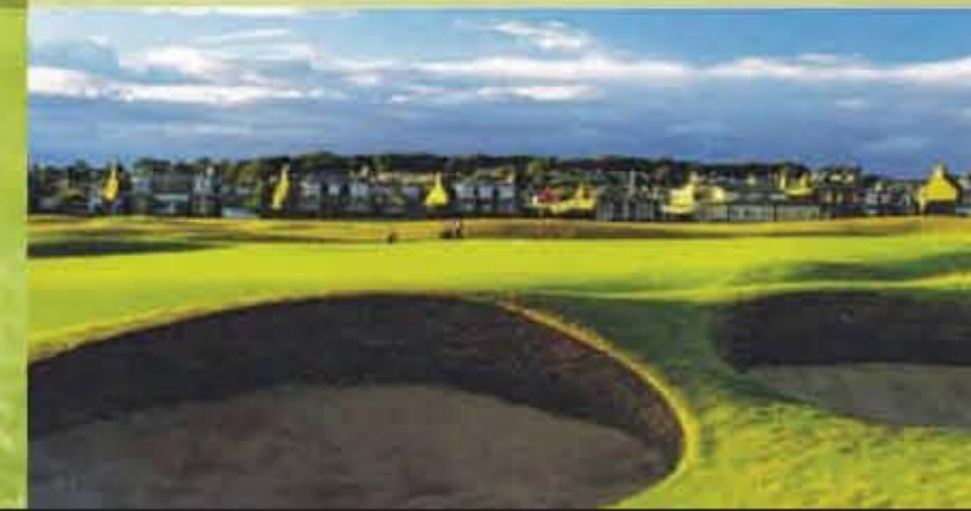
LINKSLAND GOLF COURSE

An idyllic Golf Course inspired by the best in the world