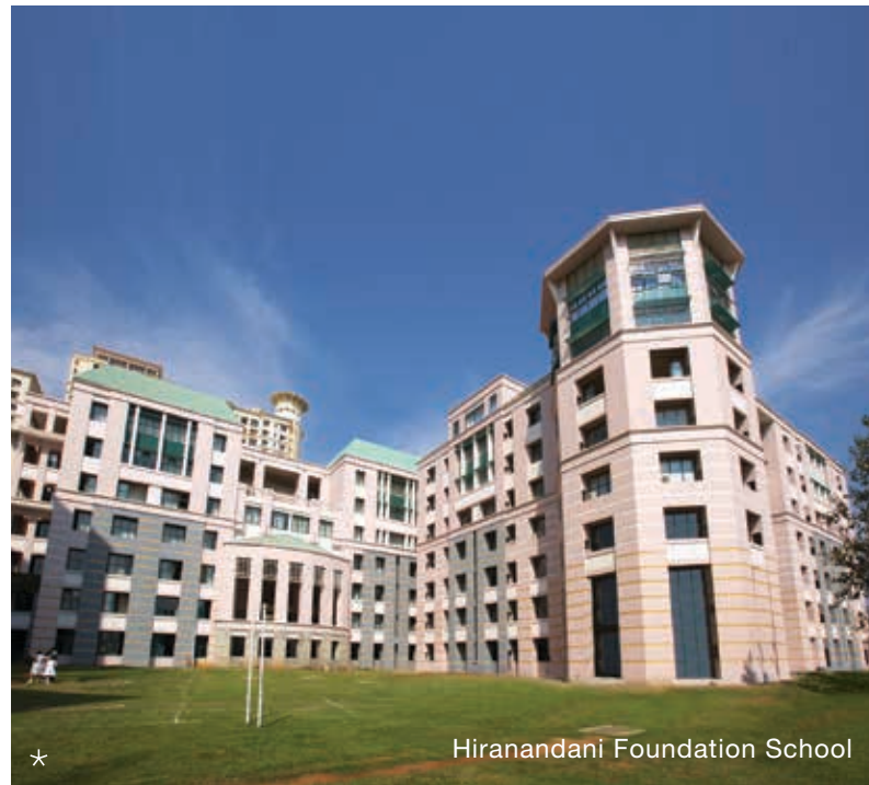
Hiranandani Foundation School