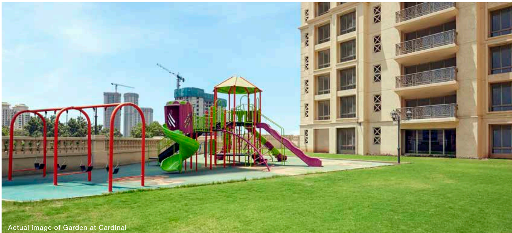
Actual image of Garden at Cardinal

Take a well-deserved break from the fast paced urban life with aesthetically visualised, private recreation spaces at the Cardinal Tower. Every element here is intentionally designed to calm your senses and renew your physical and emotional well-being, in totality. Master the art of bringing your mind, body and soul together, enjoy quality we-times, catch up with a friend or simply laze around the pool. Keep enjoying the pleasures of upscale leisure, your way!