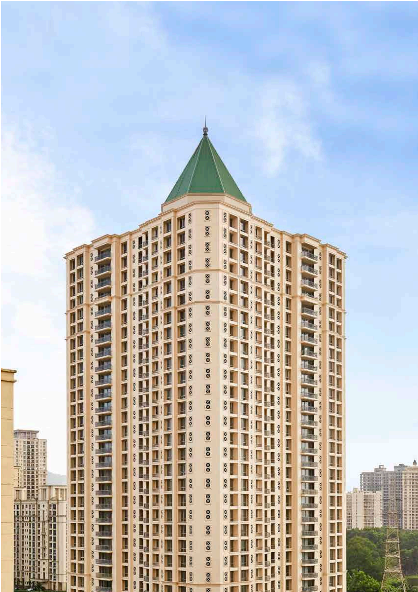
Actual image of Cardinal Building