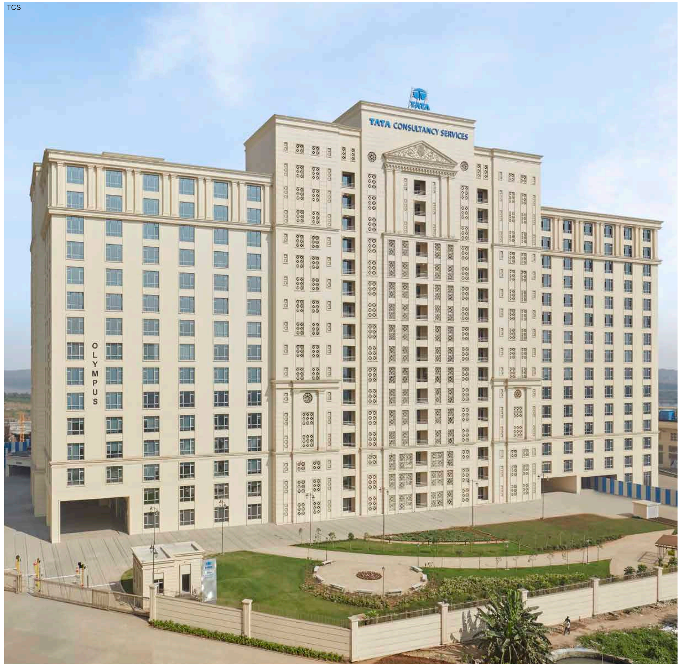
Actual image of Hiranandani Estate, Thane.