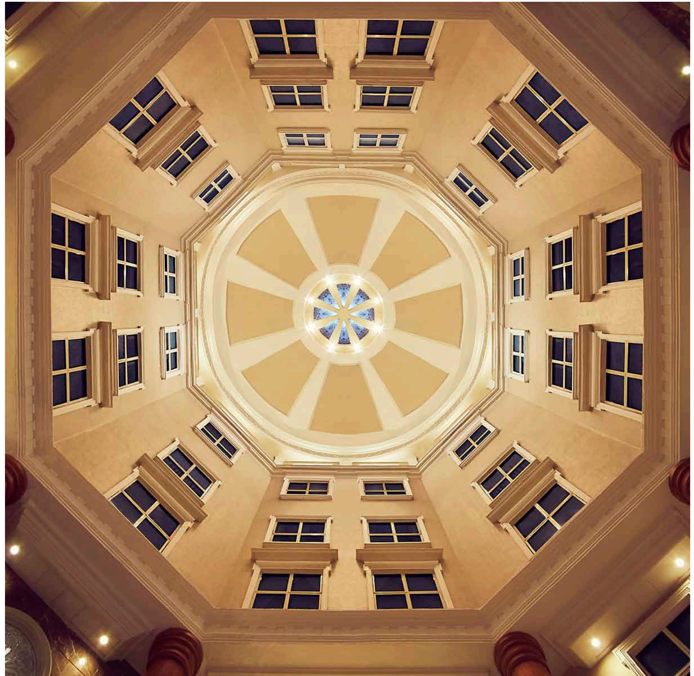
Interior image of Olympia, Hiranandani Gardens, Powai.

Every Hiranandani township reflects this commitment to raising a complete world that looks into all aspects of living. Diverse ventures come together to create an integrated experience, minutely balancing all areas of happiness. An eco-friendly ambience, convenient infrastructure, luxurious lifestyle and proximity to work are seamlessly incorporated together, adding depth and joy to daily life.