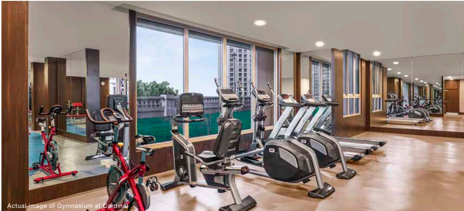
Actual image of Gymnasium at Cardinal

Your body is nothing less than a temple. The more you worship it the more you are blessed with productivity and endurance. So get ready to gift your body the most advanced form of wellness and vitality with an all-equipped private gymnasium at the tower. Go Ahead. Experience the cardinal side of wellness. Everyday!