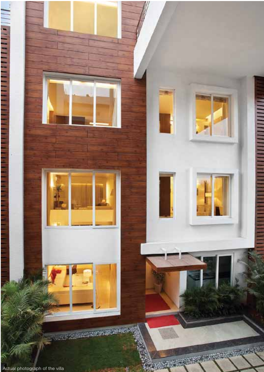
Actual photograph of the villa