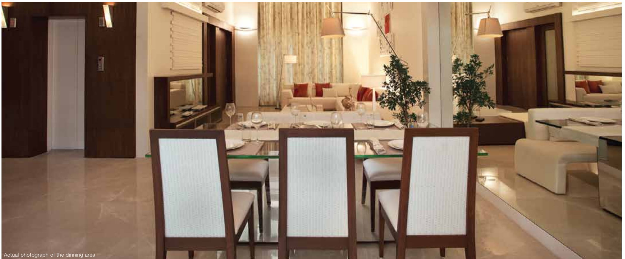
Actual photograph of the dining area