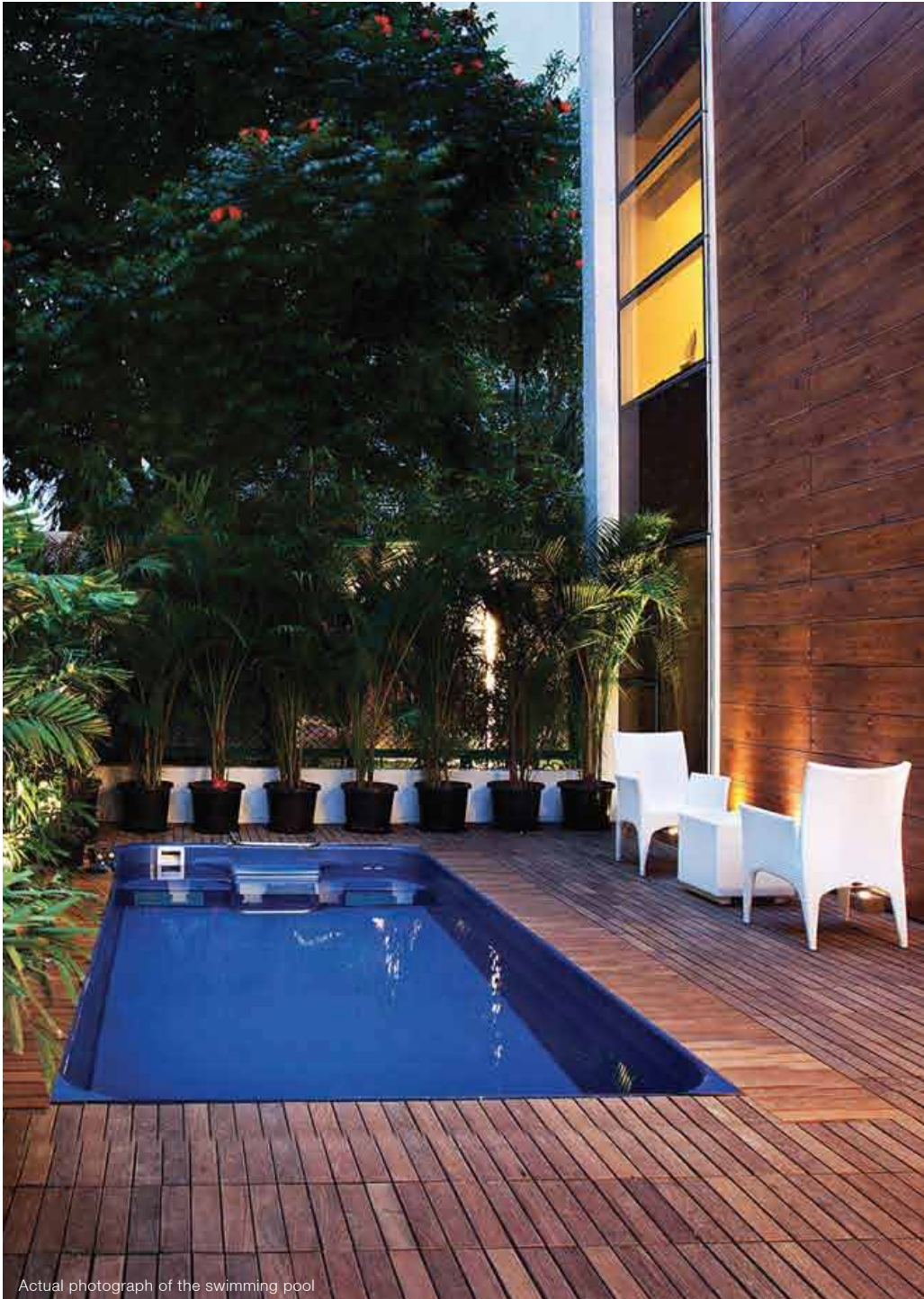
Actual photograph of the swimming pool