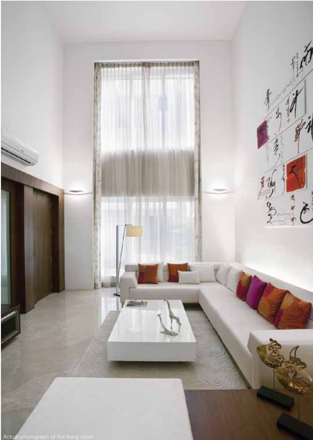
Actual photograph of the living room