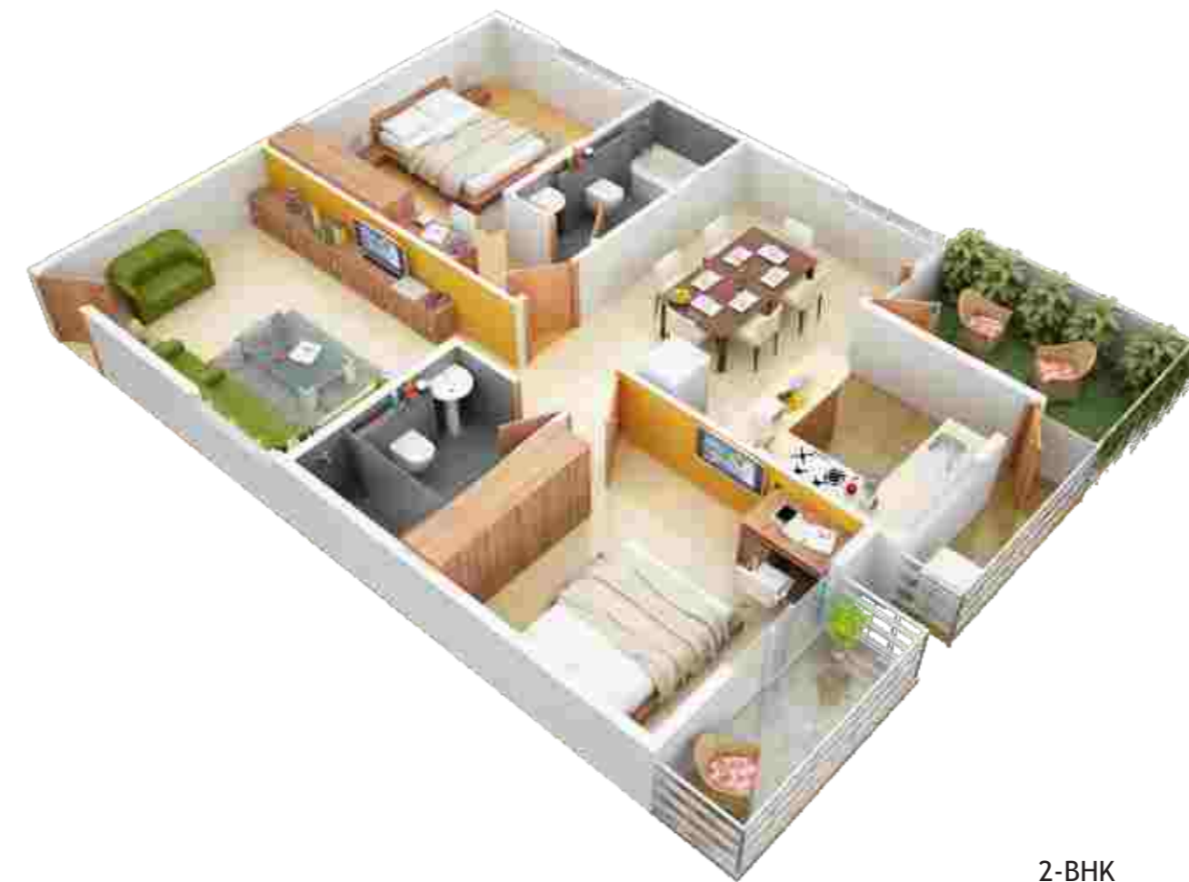
2-BHK 1200-1240 SQ FT (SBA)

A good home should offer a competitive price and quality. And quality doesn't mean having to part savings. Emerald Estancia is designed to give you a wonderful living experience without