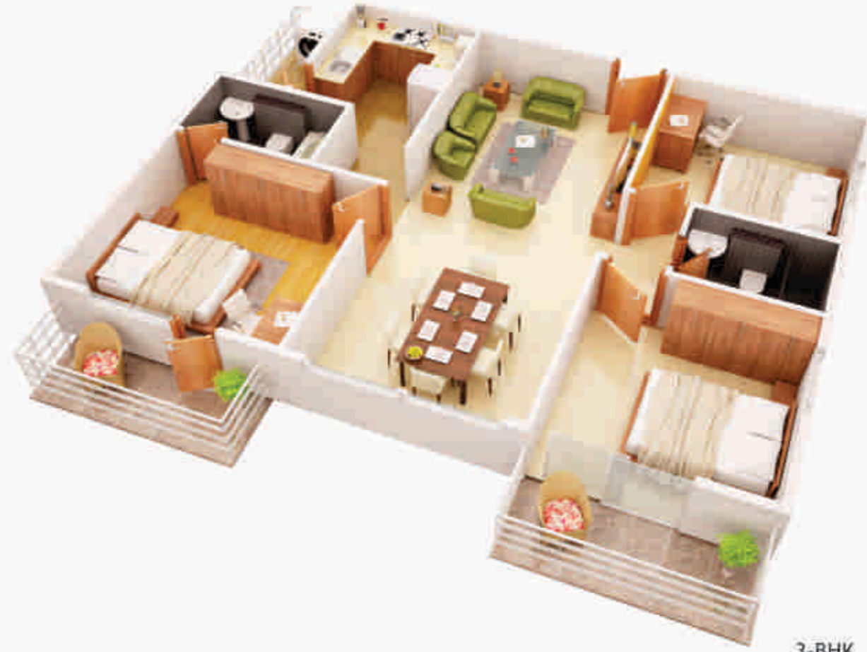
3-BHK 1300-1415 SQ FT (SBA)