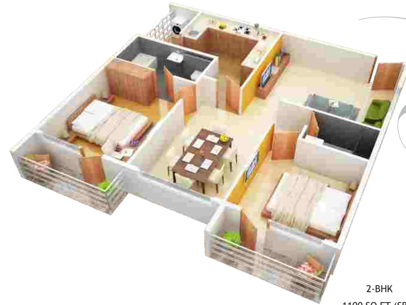
2-BHK 1100 SQ FT (SBA)