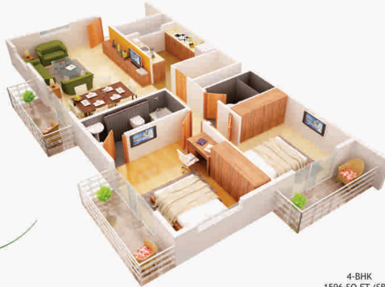
4-BHK 1596 SQ FT (SBA)