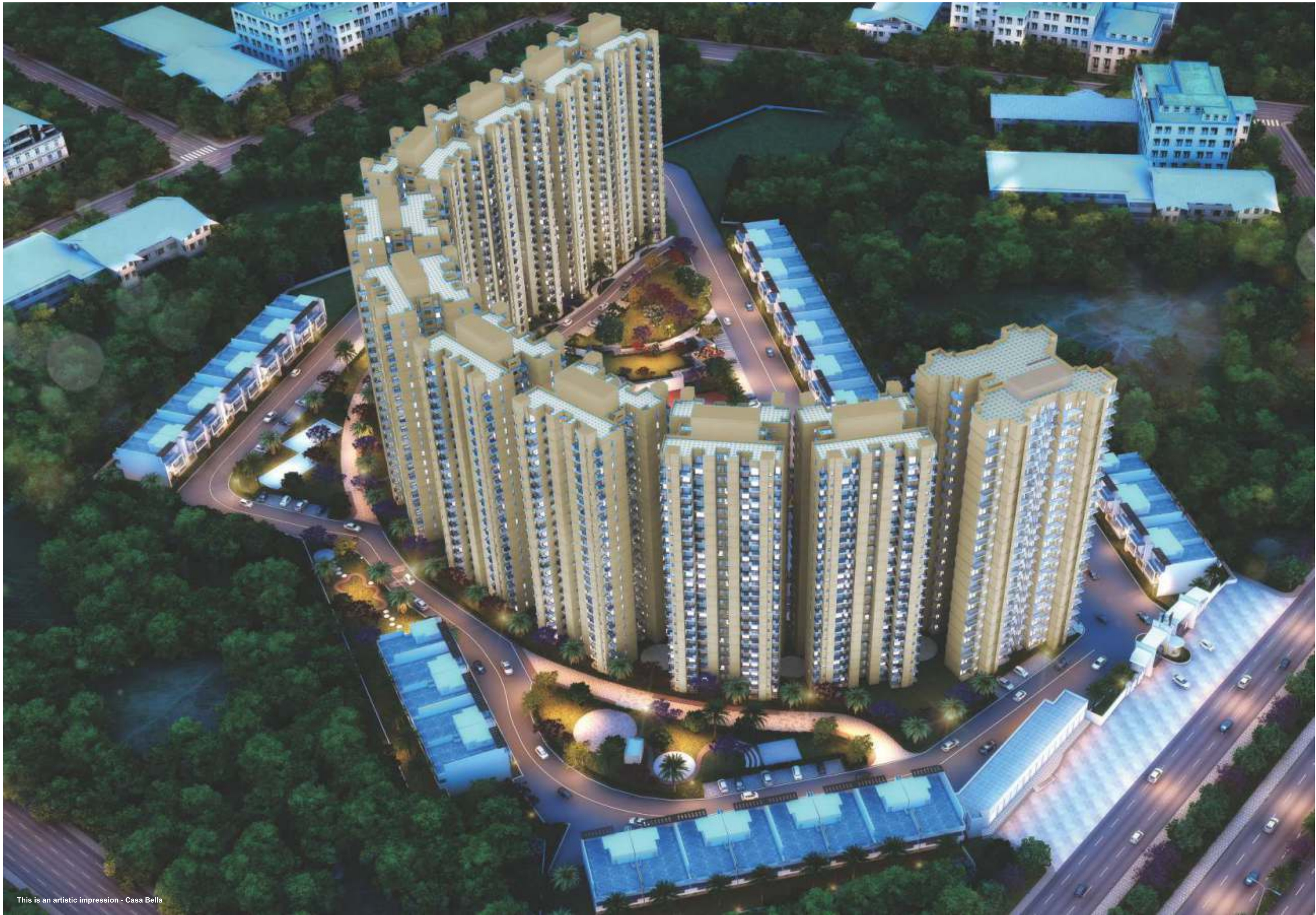
This is an artistic impression - Casa Bella