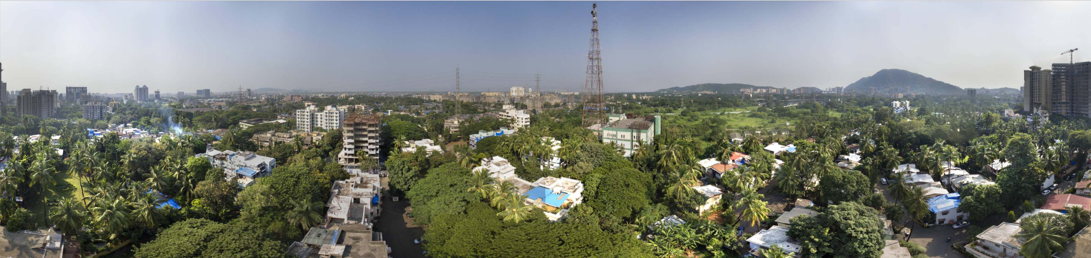
Actual View from the site