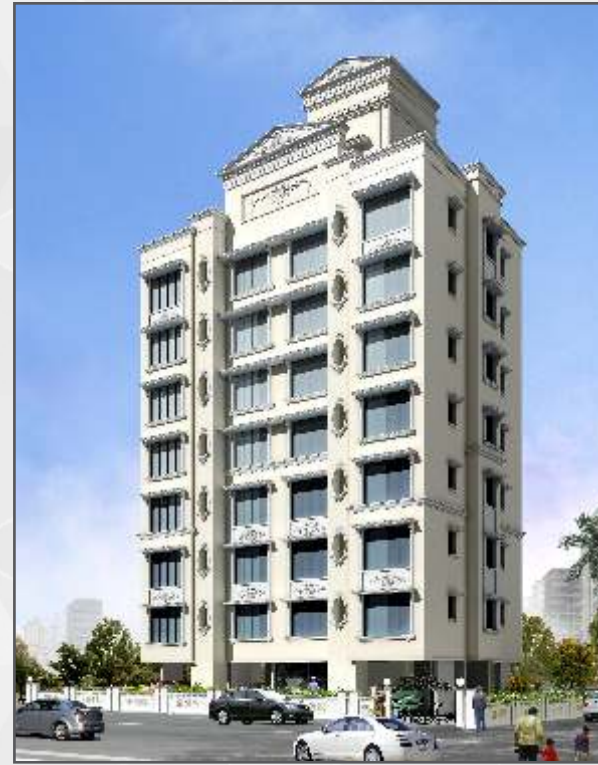
Shakti Regency , Chembur