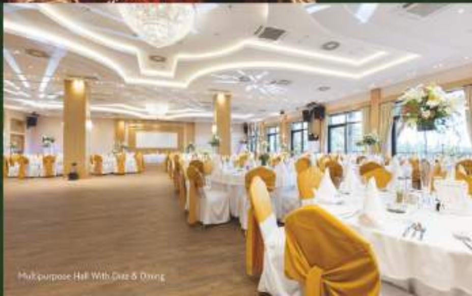
Multipurpose Hall With Dine & Dining