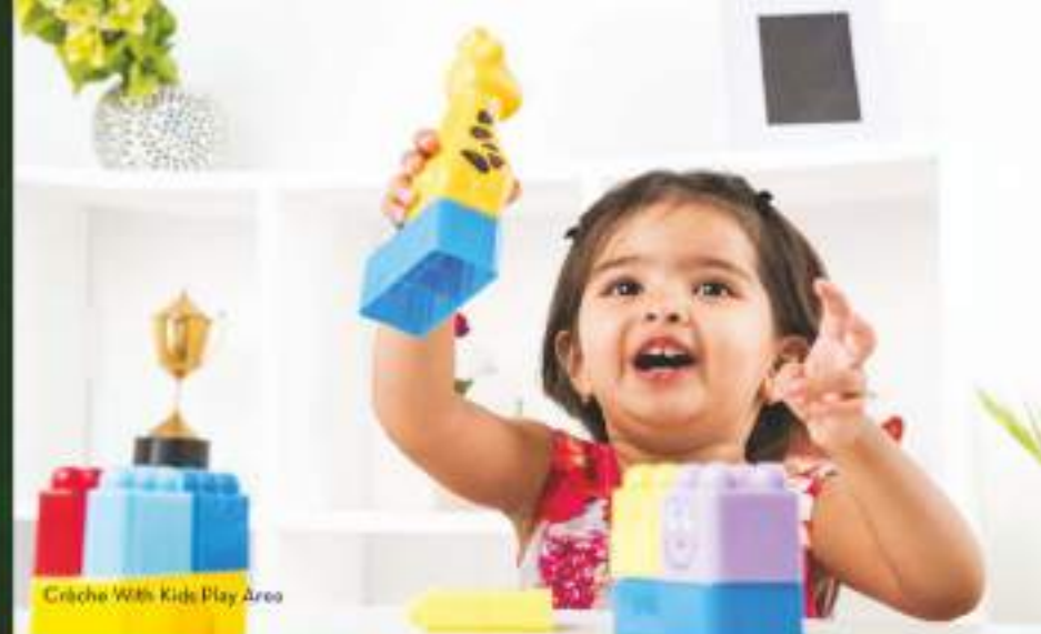
Crèche With Kids Play Area

You Are One Massage Away From A Good Mood