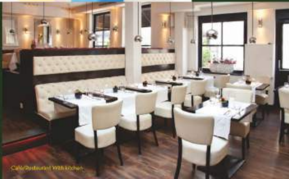
Cafe/Restaurant With Kitchen