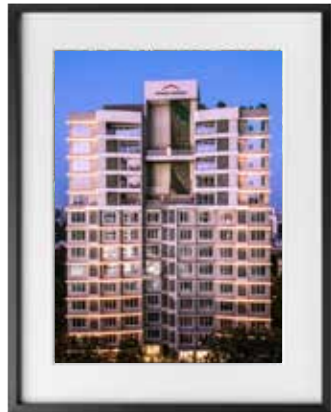
BADRINATH Khar West, Mumbai 4 bedroom residences