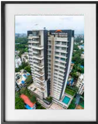
EPITOME Chembur, Mumbai 4 & 5 bedroom residences