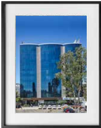
SUPREME HEADQUARTERS Baner, Pune Commercial spaces