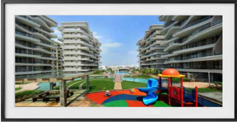
PALLACIO Baner, Pune 3 & 4 bedroom residences