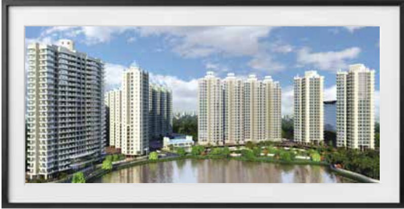
LAKE HOMES Powai, Mumbai 2 & 3 bedroom residences