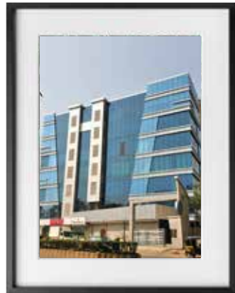
HYDE PARK Andheri East, Mumbai Commercial spaces