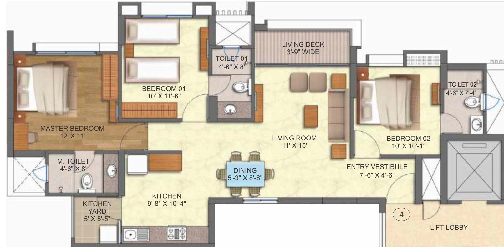
3 BHK (TYPE 02) BLOCK NOS: J & K (Phase 2) FLOOR LEVELS: 2nd - 3rd, 8th - 10th