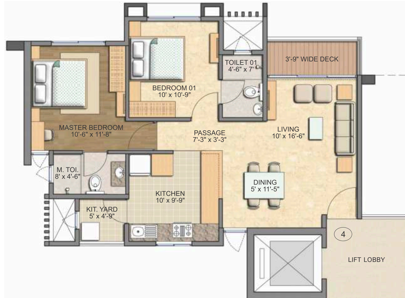
2 BHK BLOCK NOS: A TO D, K & L (Phase 1) BLOCK NOS: E TO H (Phase 2) FLOOR LEVELS: 4th - 7th, 10th - 13th