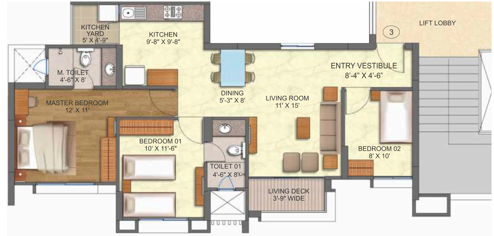
2.5 BHK BLOCK NOS: J & K (Phase 2) FLOOR LEVELS: 2nd - 3rd, 8th - 10th