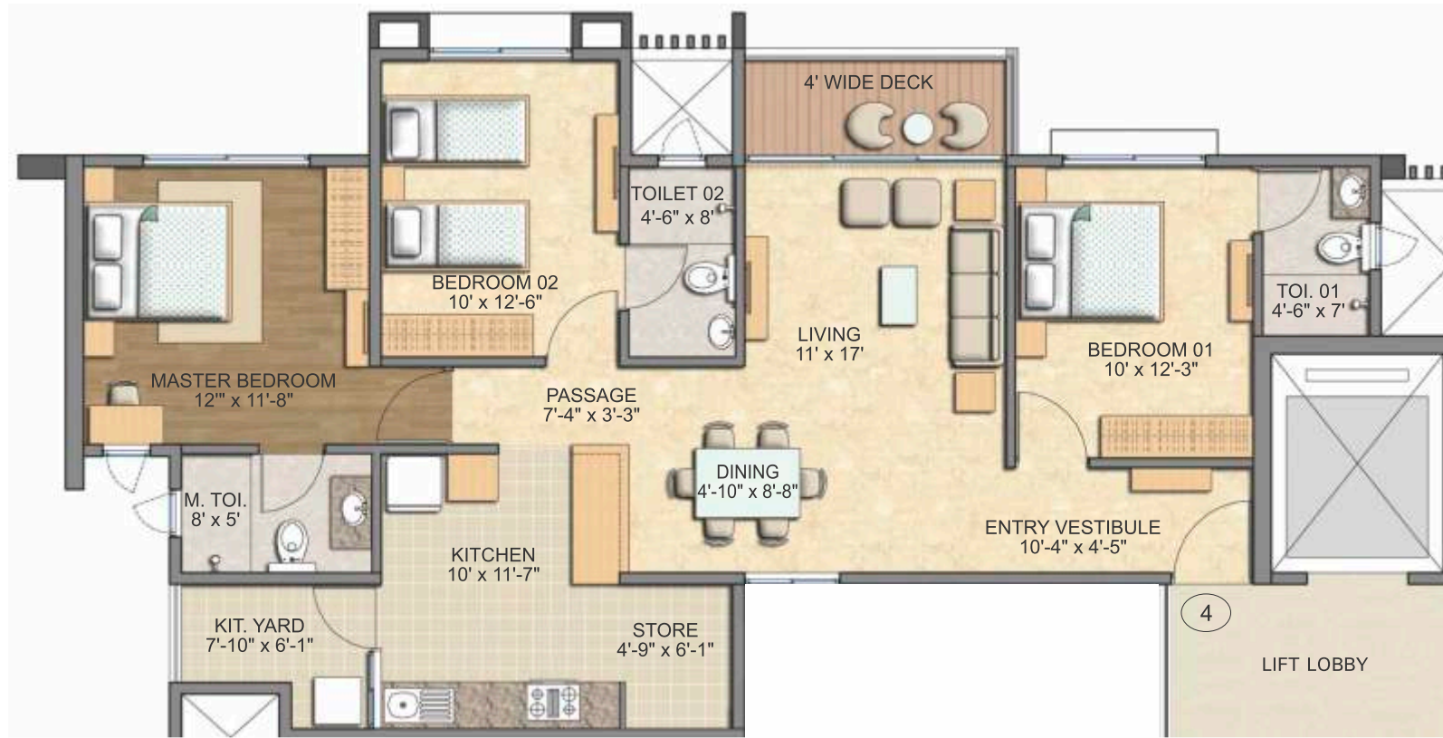
3 BHK (TYPE 01) BLOCK NOS: E TO I (Phase 1) FLOOR LEVELS: 4th - 7th, 10th - 13th