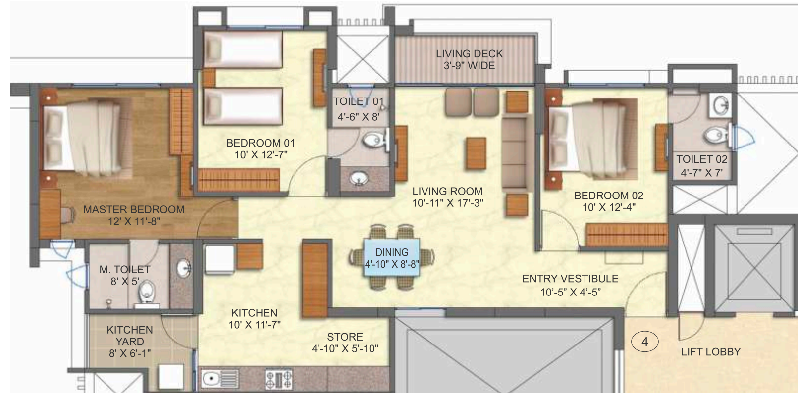
3 BHK (TYPE 01A) BLOCK NOS: I & L (Phase 2) FLOOR LEVELS: 2nd - 3rd, 8th - 10th