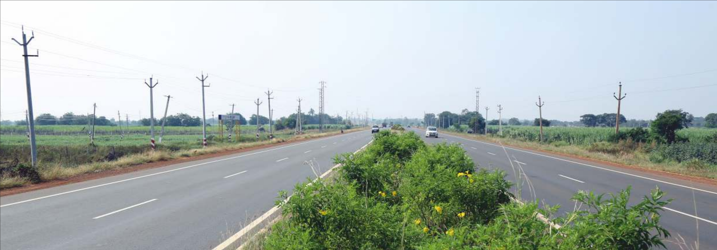
NH No. - 65 To Hyderabad