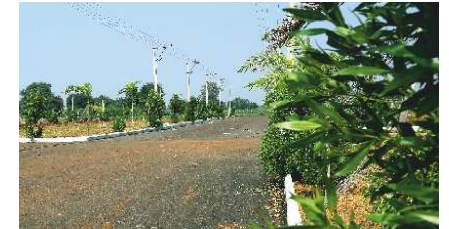
Actual Photographs of Site

5 Mins from Mahindra and Mahindra Group of properties