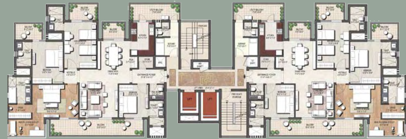
4 BHK + SERVANT ROOM TYPICAL FLOOR PLAN