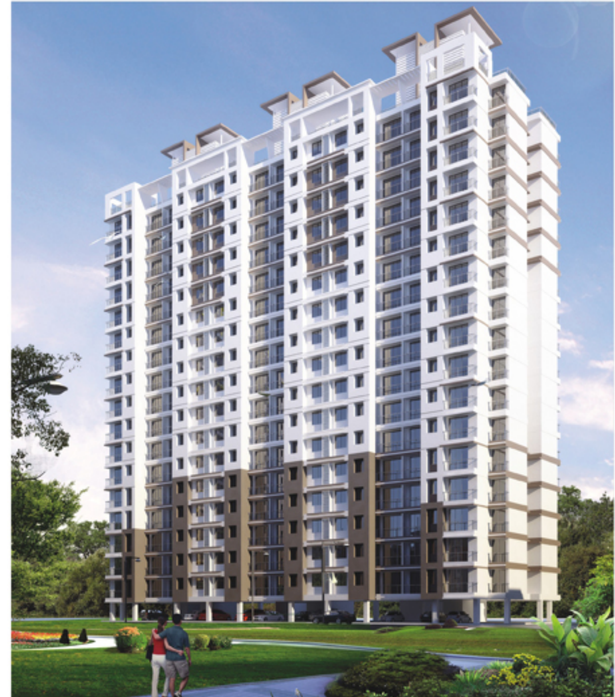
Behind Parshwanath College, Near Hyper City Mall & IT Park, Ghodbunder Road, Thane (W).