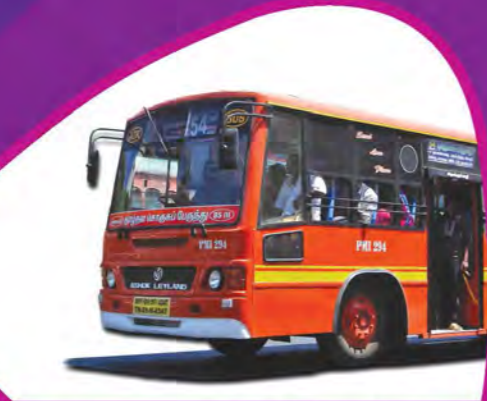
Bus Terminus (5 Minutes Drive)