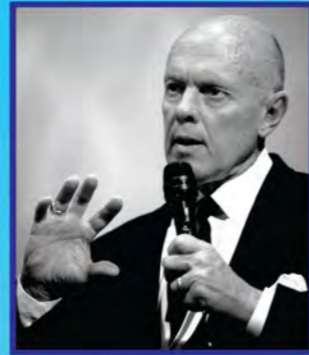
Dr. Stephen R. Covey (USA) The creator of the 7 Habits of Highly Effective People