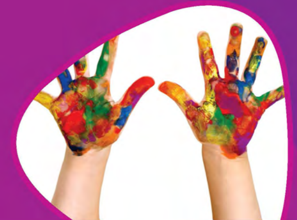
Painting & Sketching