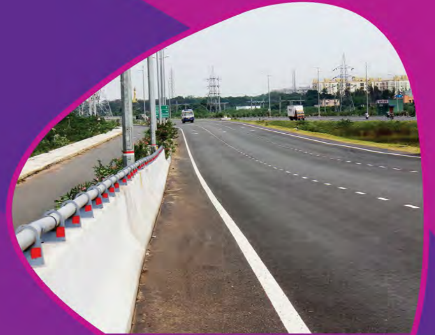
400 FEET OUTER RING ROAD CHENNAI (ORR)