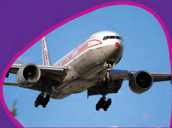
Airport 9 Minutes Drive