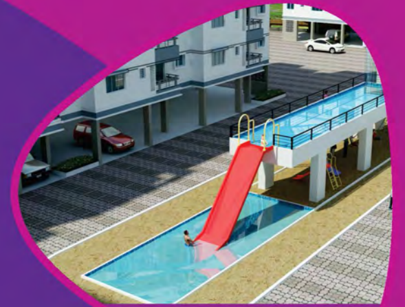
Multi level Water Deck