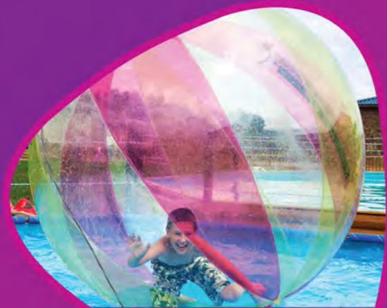
Water Balloon Games