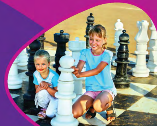
Jumbo Scale Chess