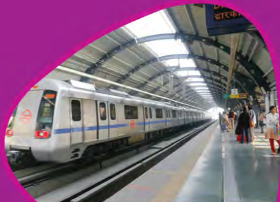
Railway Station (15 Minutes Drive)