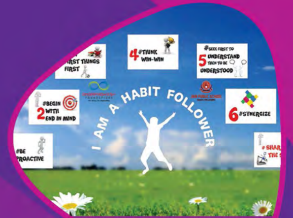
Leader in Me