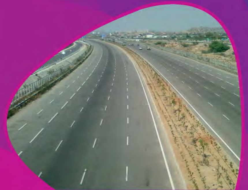
INNER RING ROAD CHENNAI (IRR)