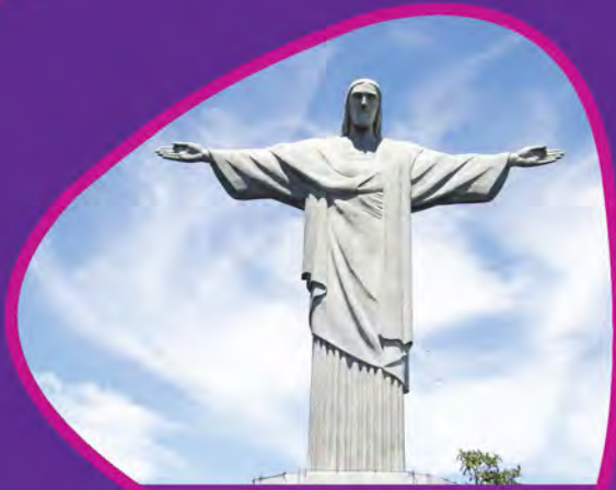
Christ the Redeemer