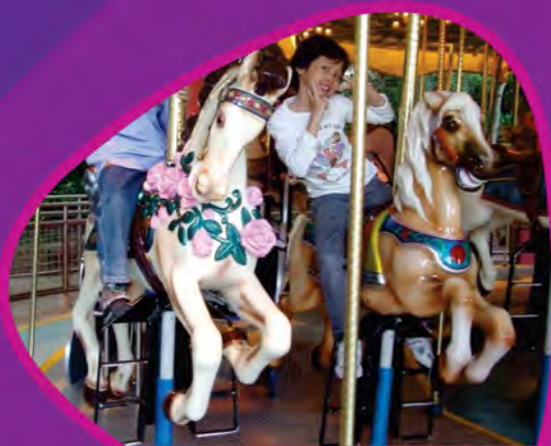
Merry Go Round