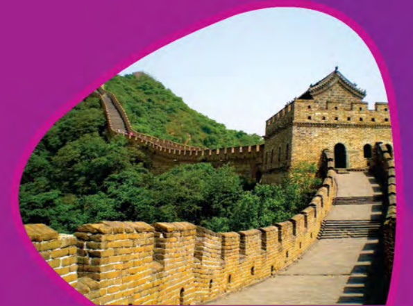
Great Wall of China