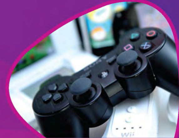
Semi Virtual Games