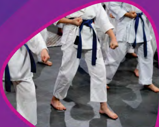
Karate for Kids