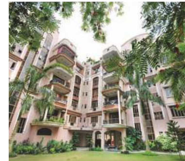
Heritage Mayfair | Ballygunge