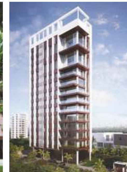
The Unimark Grand | Ballygunge