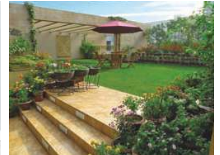
Discover the harmony of life

Meditation zone | Decorated terrace | Community hall | Kid's play area