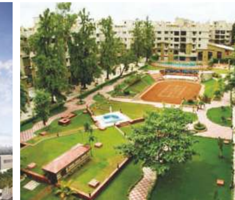
Sherwood Estate | Narendrapur