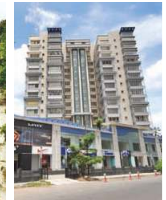
Astral | Ballygunge