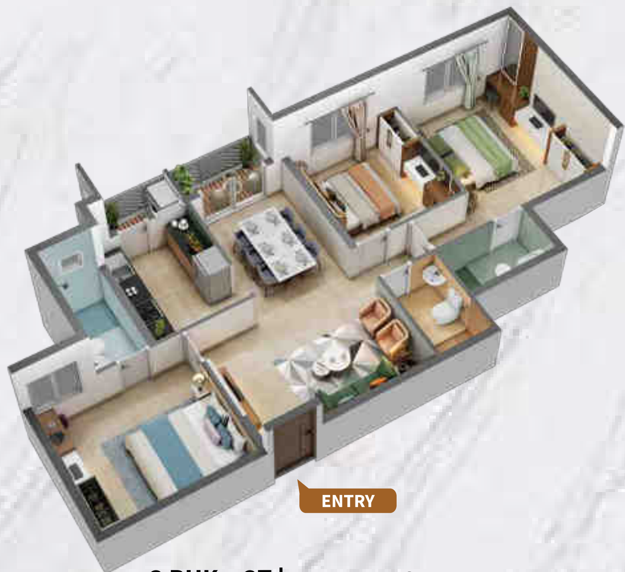
3 BHK + 3T | 1334-1412 Sq. Ft.