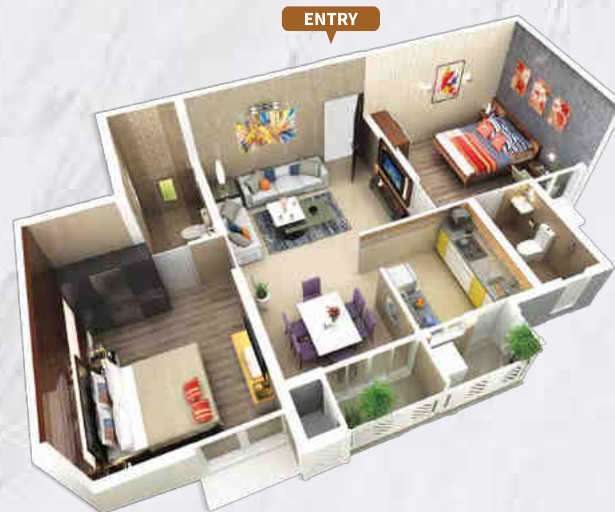
2 BHK + 2T | 1035 Sq. Ft.