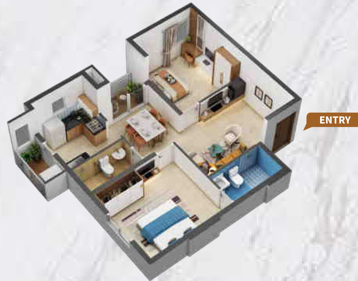
2 BHK + 2T | 992 Sq. Ft.