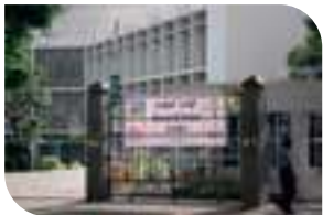
Bosch 3 Km.