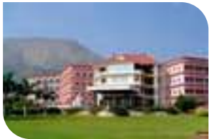
Amritha College 50 m.

Today, commuting is the biggest challenge for any 'citizen'. At Klassik, we're well aware of the hassle and have located Klassik Landmark on Sarjapur main road from where commuting to most of the places will be a breeze.