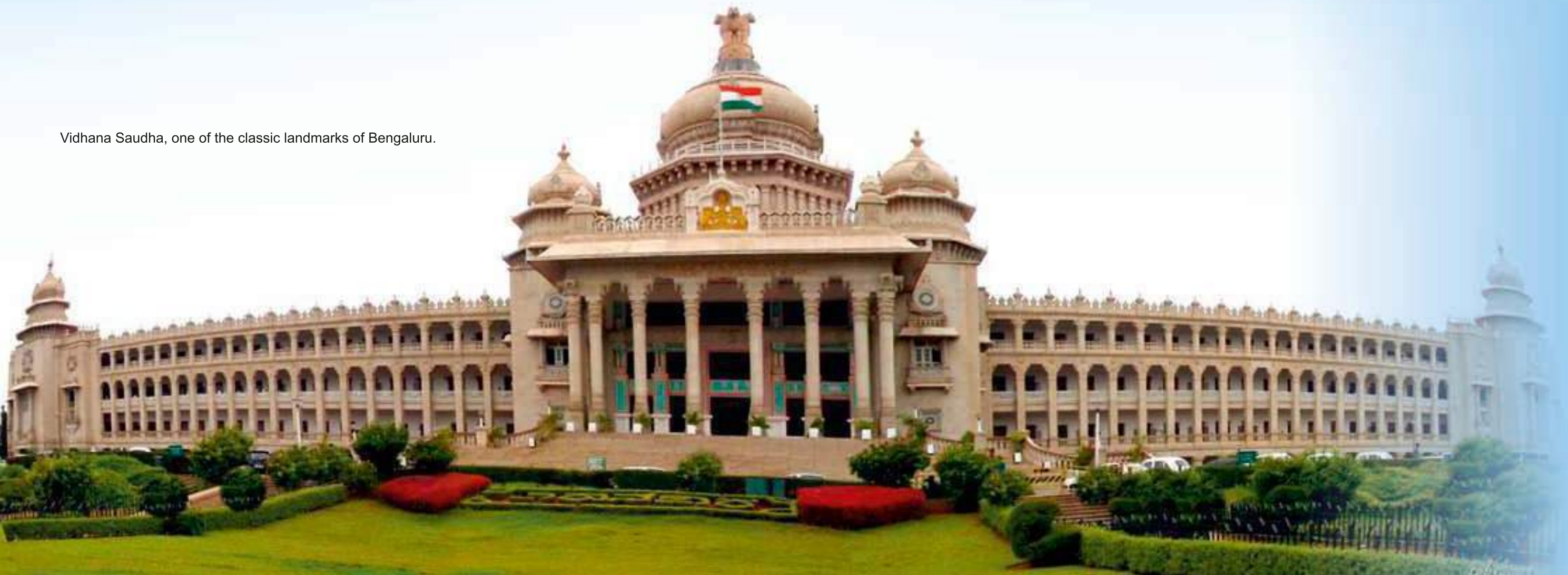
Vidhana Soudha, one of the classic landmarks of Bengaluru.