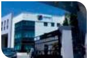
Wipro 2.5 Km.