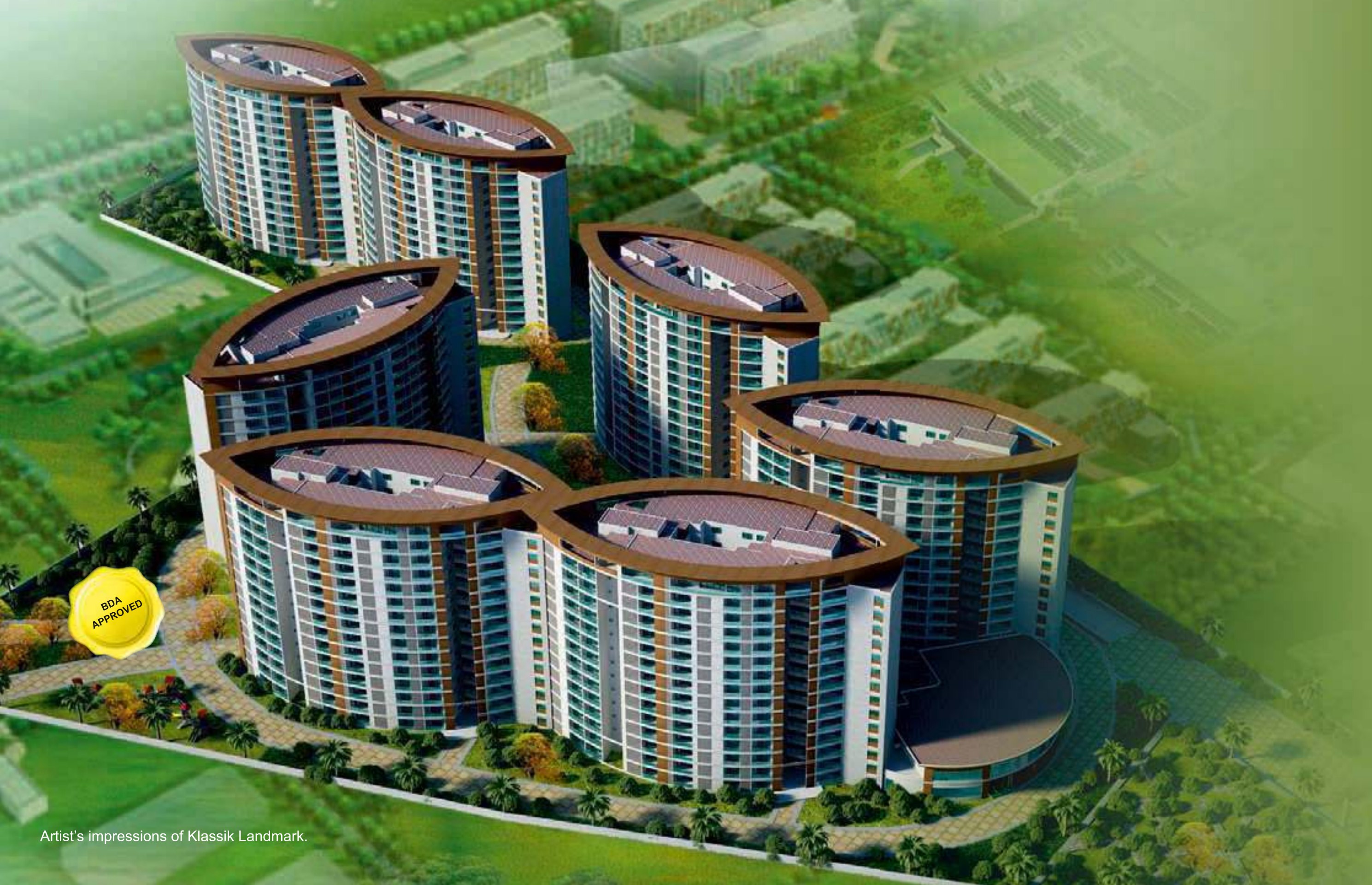
Artist's impressions of Klassik Landmark.