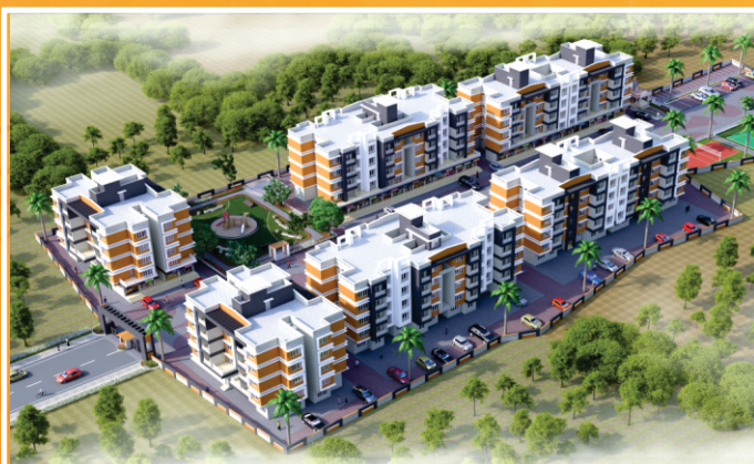
Gunaji Vasudev Complex