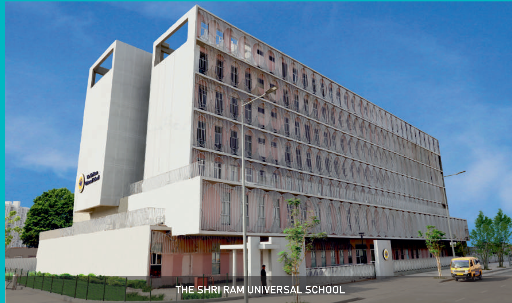
THE SHRI RAM UNIVERSAL SCHOOL