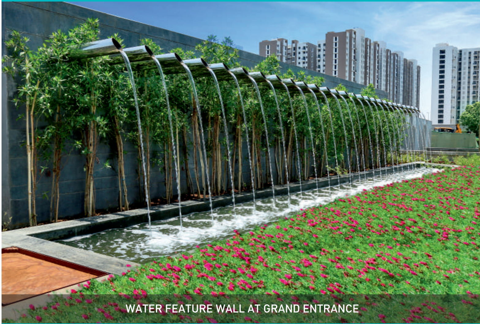
WATER FEATURE WALL AT GRAND ENTRANCE