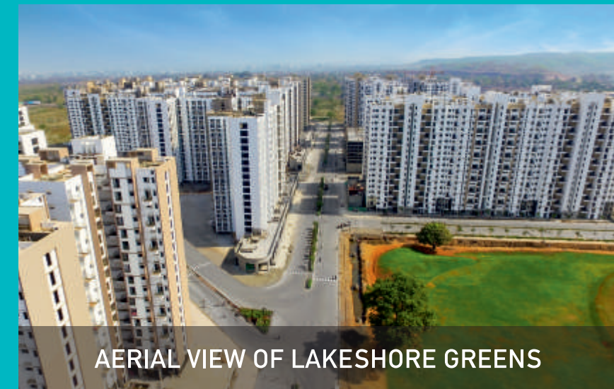
AERIAL VIEW OF LAKESHORE GREENS