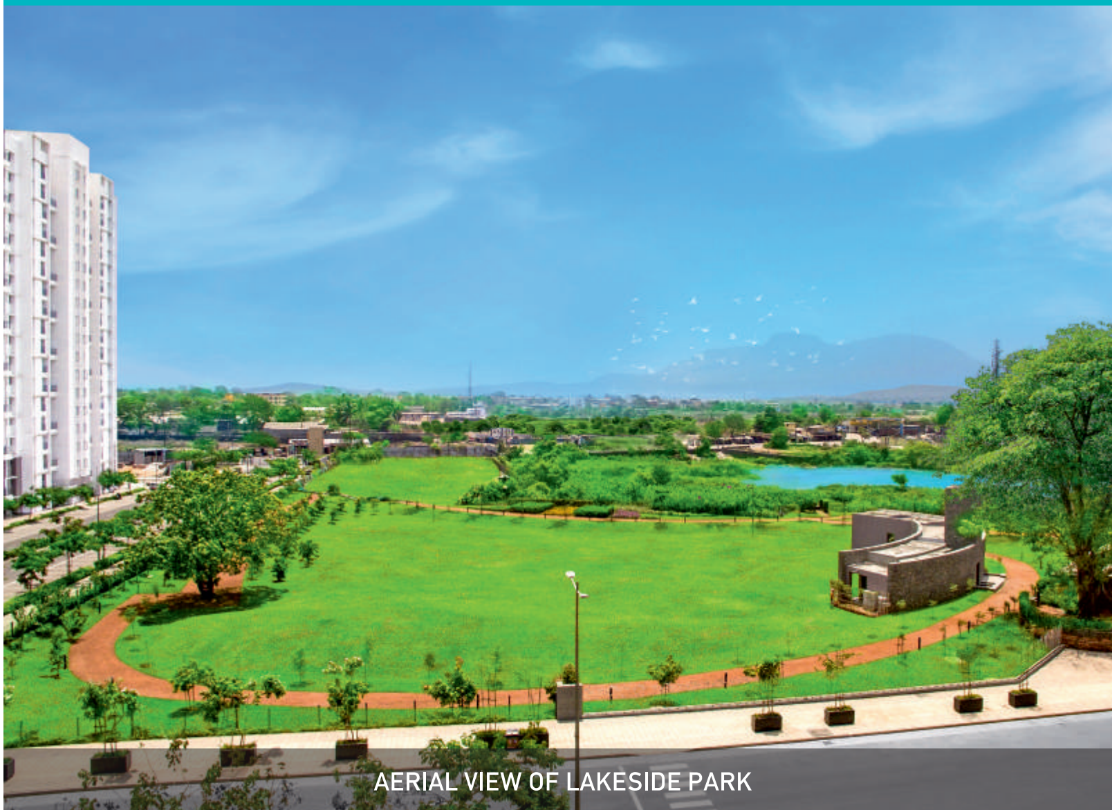
AERIAL VIEW OF LAKESIDE PARK