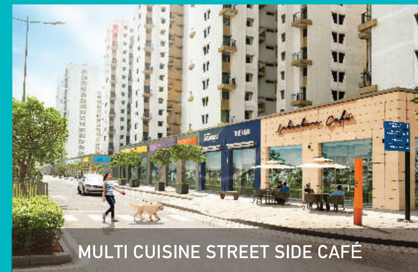
MULTI CUISINE STREET SIDE CAFÉ