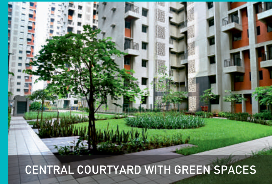
CENTRAL COURTYARD WITH GREEN SPACES