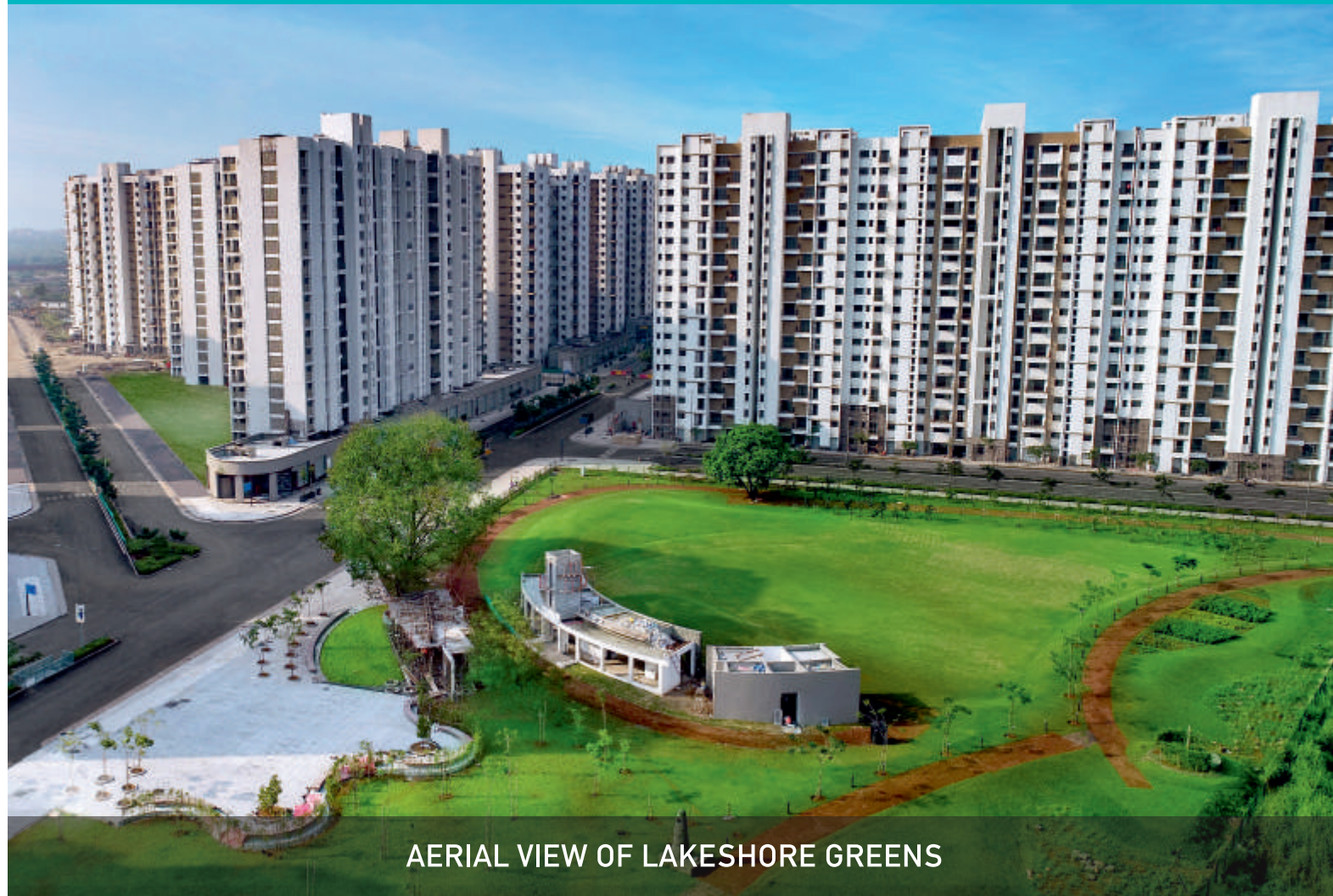
AERIAL VIEW OF LAKESHORE GREENS