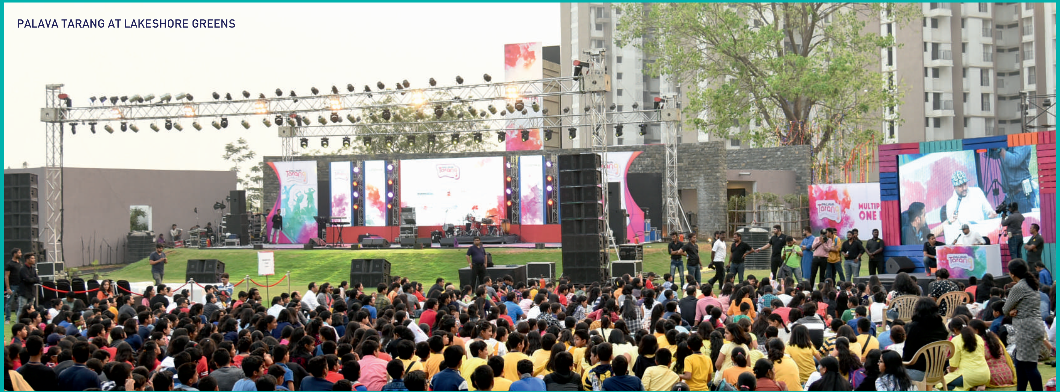
PALAVA TARANG AT LAKESHORE GREENS