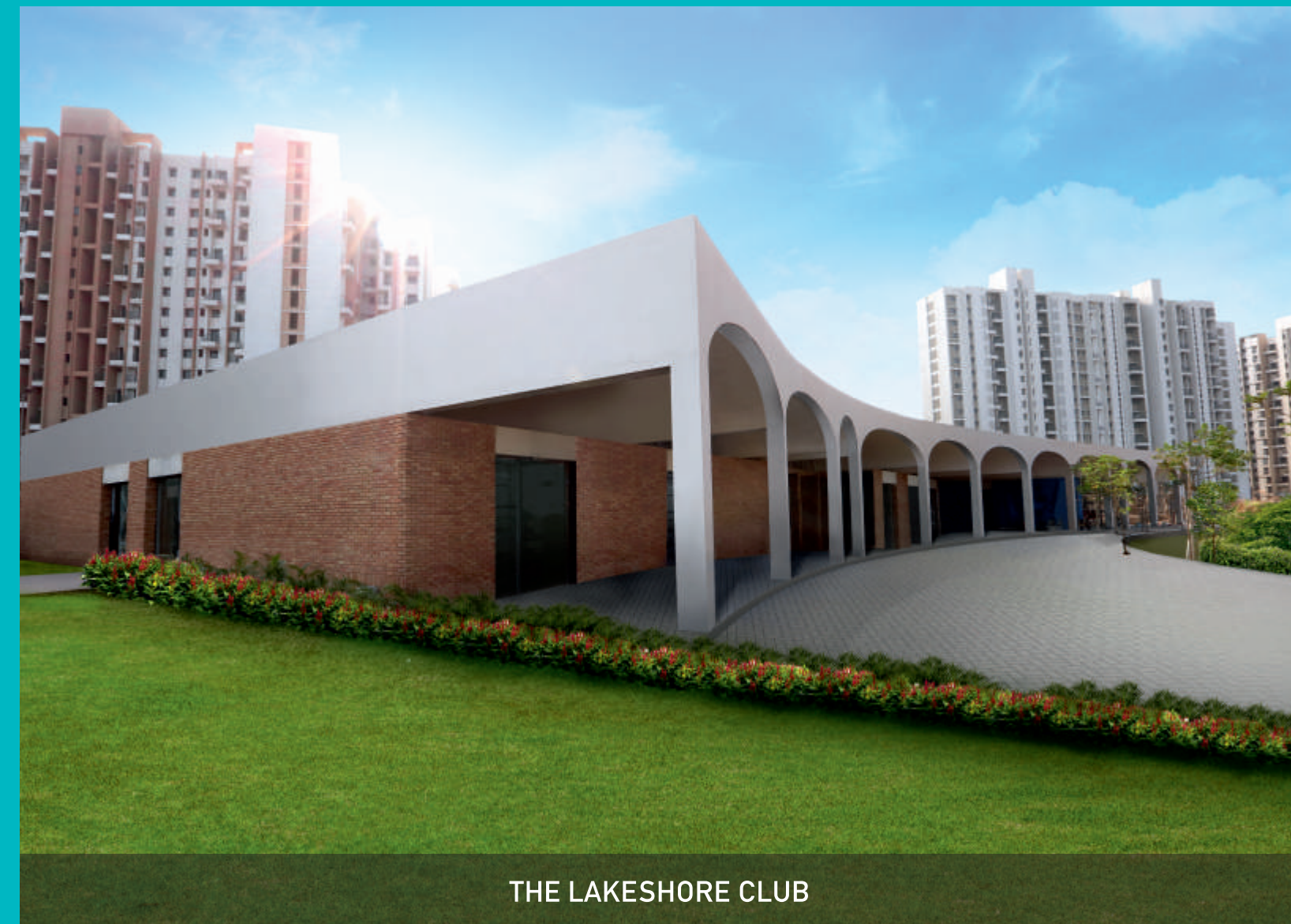
THE LAKESHORE CLUB