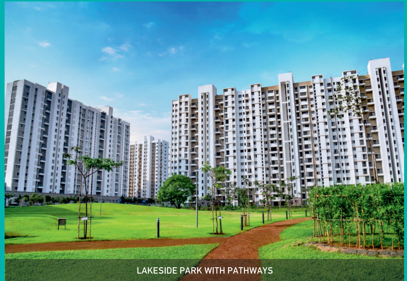
LAKESIDE PARK WITH PATHWAYS