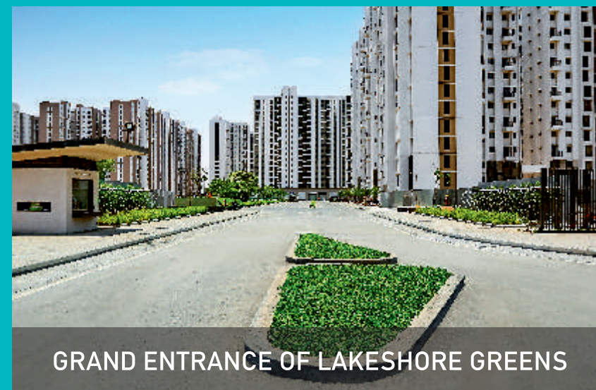
GRAND ENTRANCE OF LAKESHORE GREENS