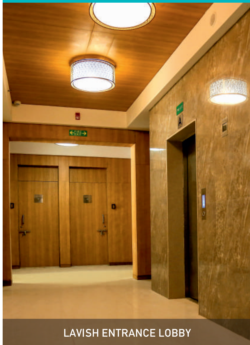
LAVISH ENTRANCE LOBBY