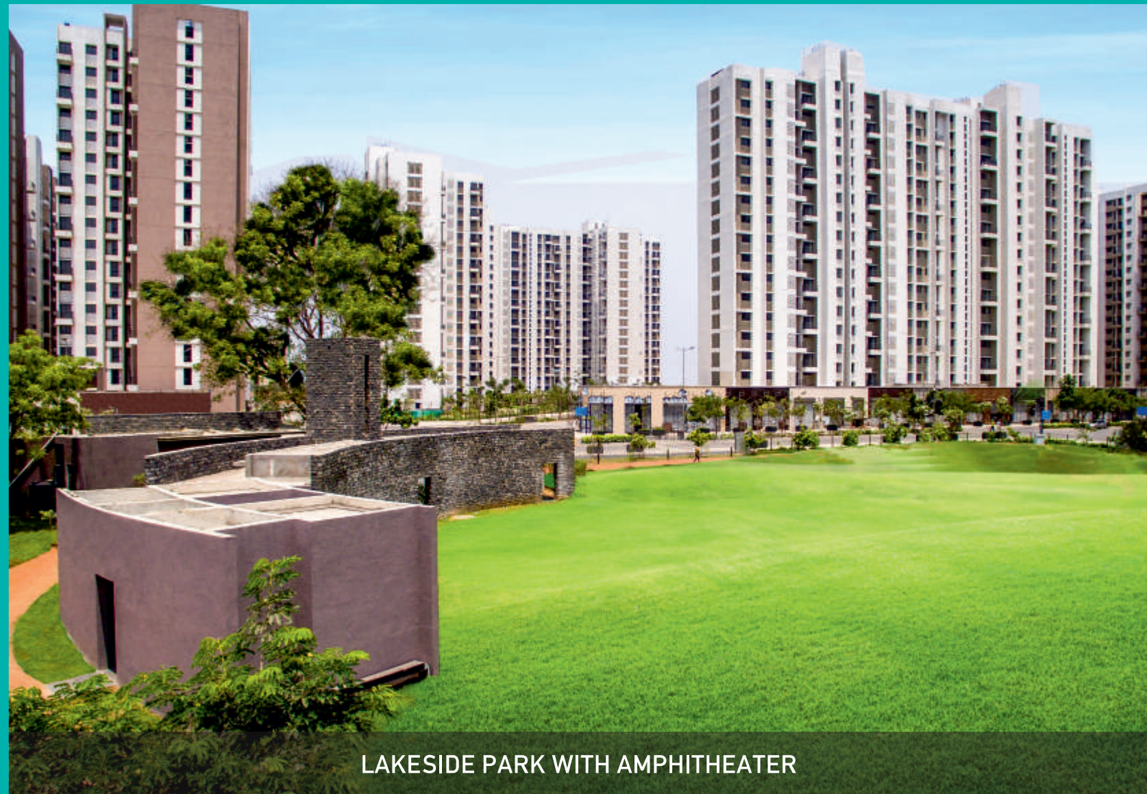
LAKESIDE PARK WITH AMPHITHEATER