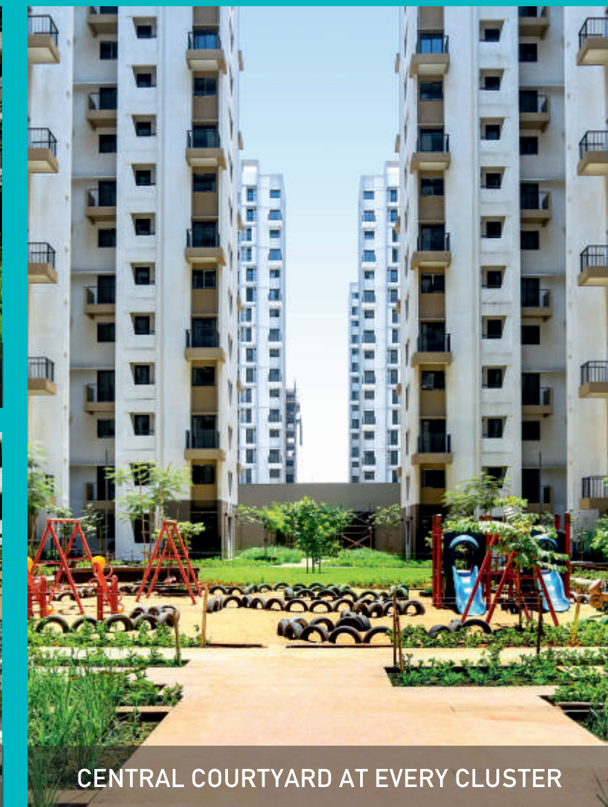
CENTRAL COURTYARD AT EVERY CLUSTER