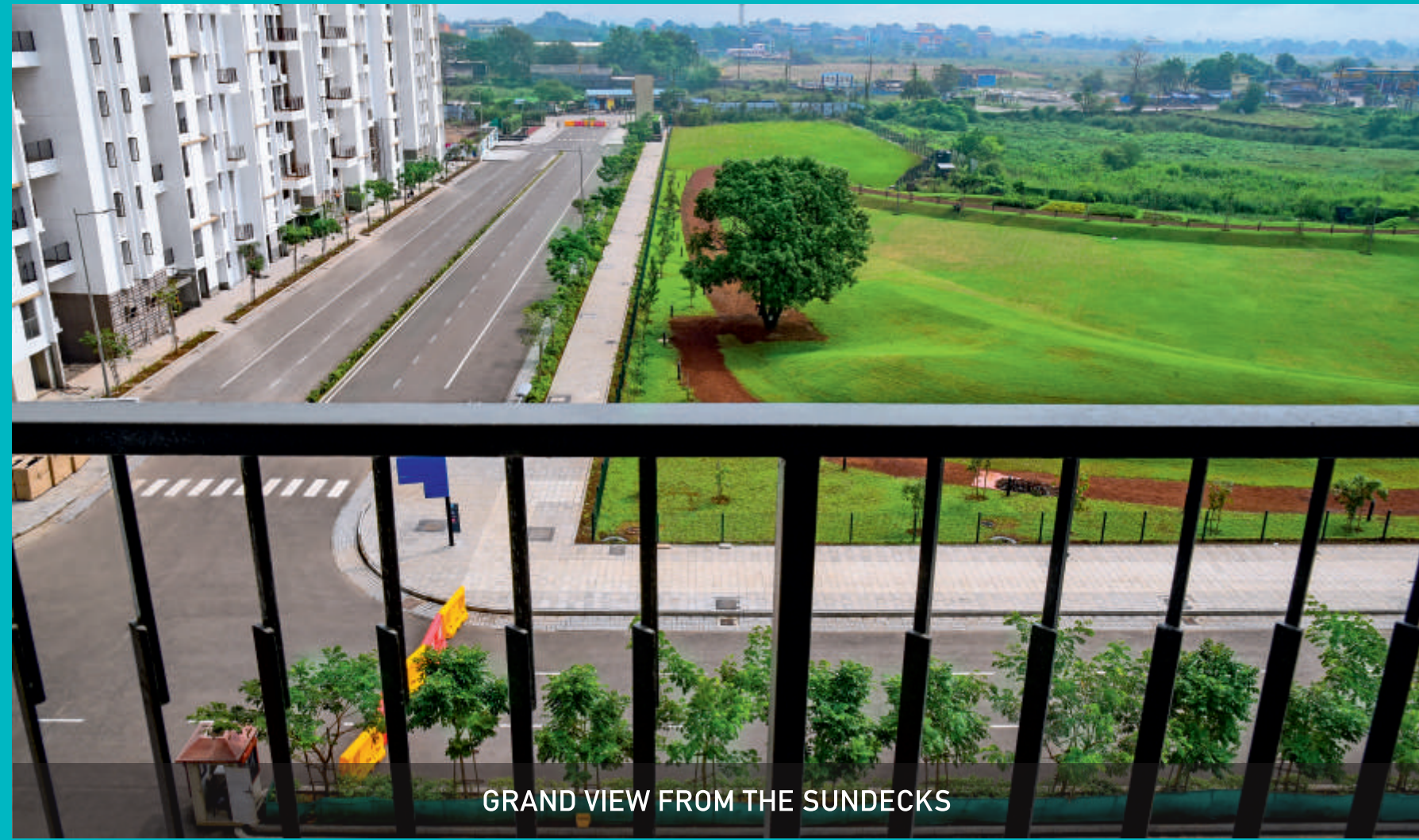
GRAND VIEW FROM THE SUNDECKS