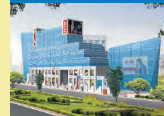
SOHNA ROAD, GURGAON