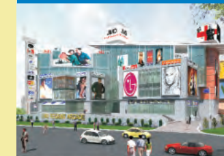
M.G. ROAD, GURGAON