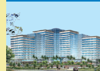
SOHNA ROAD, GURGAON