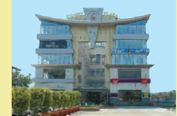
M.G. ROAD, GURGAON