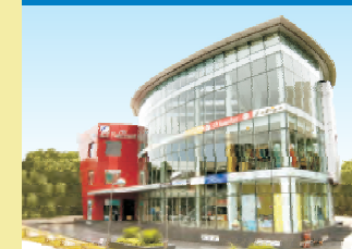
G.K.-II, NEW DELHI