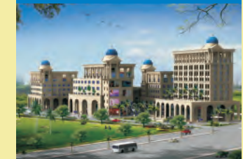
Sec - 62, GURGAON