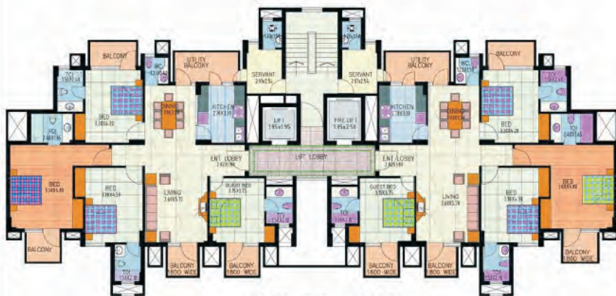
FOUR BED TYPICAL FLOOR PLAN SUPER AREA = 2315 sqft