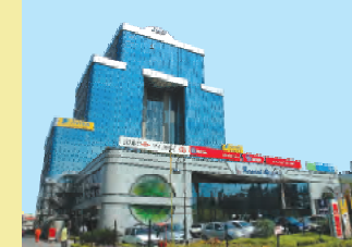
M.G. ROAD, GURGAON