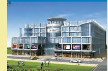
M.G. ROAD, GURGAON