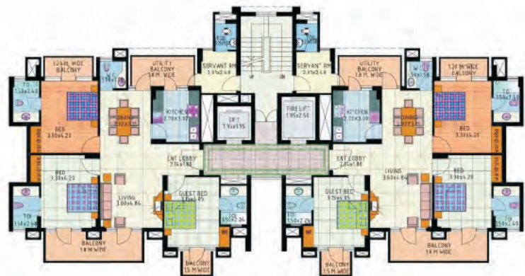
THREE BED ROOM TYPICAL FLOOR PLAN SUPER AREA = 1875 sqft