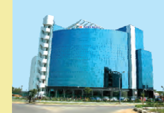
NH 8, GURGAON