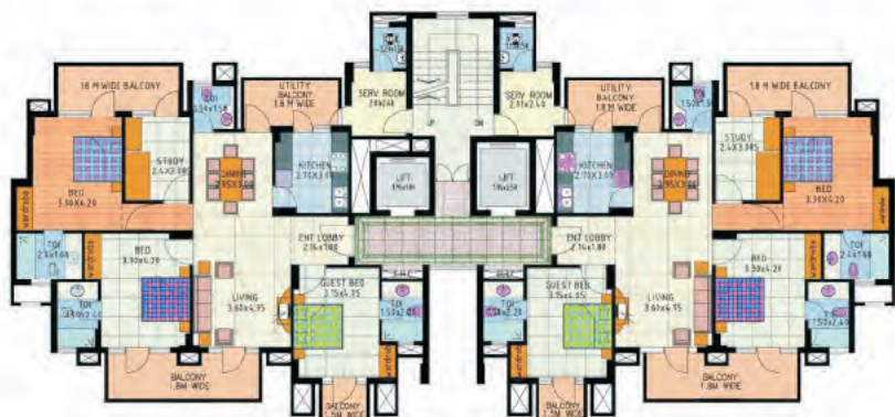
THREE BED STUDY TYPICAL FLOOR PLAN SUPER AREA = 2020 sqft