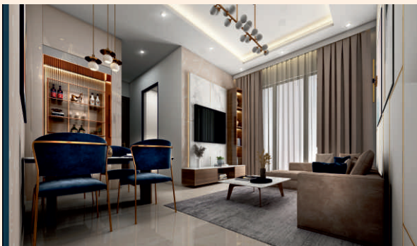
Living and Dining