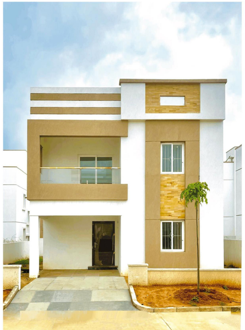
Villa from our project BHEL MAYFAIR

Telangana Shrama Shakti Awardee Ex-President All India BHEL HMS Employees Federation