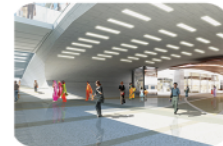
Seawood Railway Station

The 10km long Palm Beach Road is a six-lane state-of-the-art road that connects Vashi to CBD-Belapur running parallel to the Thane creek. it is a twin of the Marine Drive.