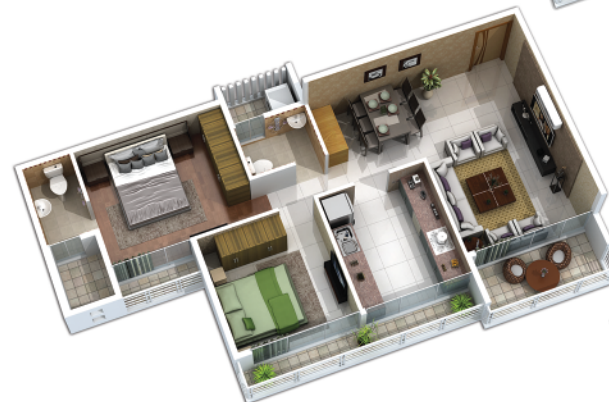
2 BHK 3D Plan