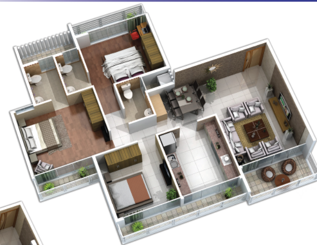
2 BHK 3D Plan