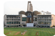
D. Y. Patil Stadium

Seawoods-Darave, also known simply as Seawoods is a railway station on the Harbour Line of the Mumbai Suburban Railway in the Nerul node. The Seawoods Station was named after CIDCO's flagship township, the Seawoods Estate, that was built to attract returning NRIs.