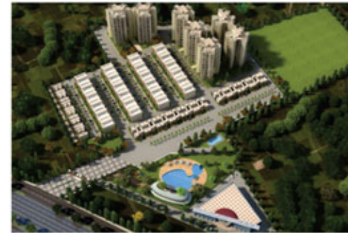
EKDANT Palace Meerut

To know more about our completed projects visit to our website