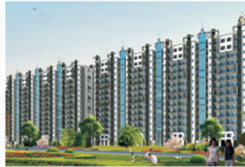
EKDANT Rawal Residency Greater Noida