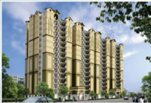
EKDANT DRONAGIRI Vasundhara, (Gzb.)