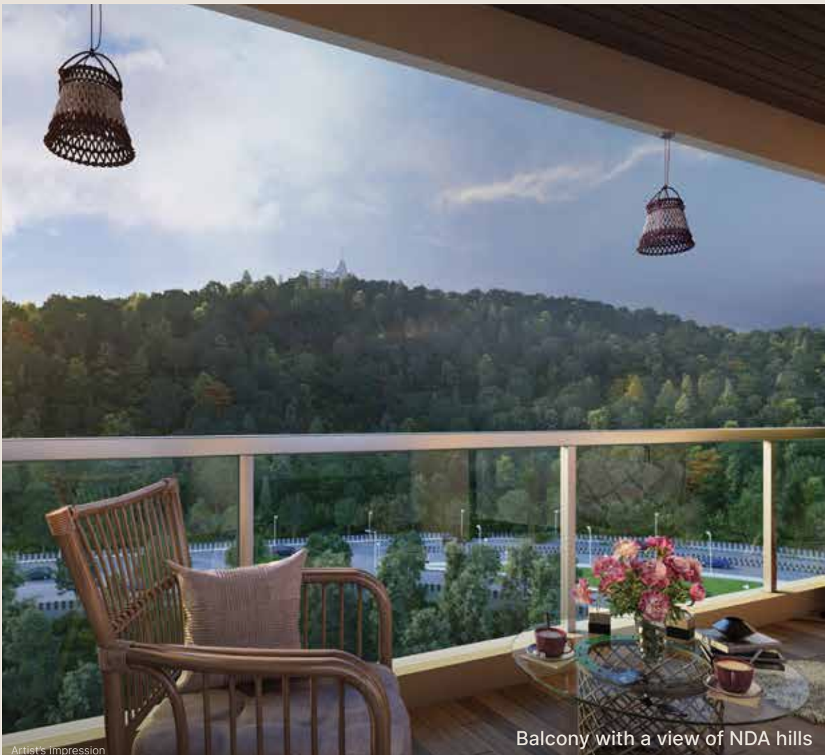
Balcony with a view of NDA hills

Now enjoy the uninterrupted view of the NDA hills from the comfort of your home at SOBHA Nesara. Here, life takes a much-needed break from the everyday grind, in nature's embrace.