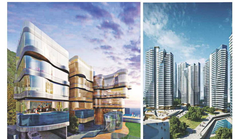
Projects designed by Aedas, Singapore