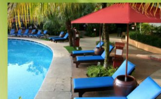
Open air swimming pool