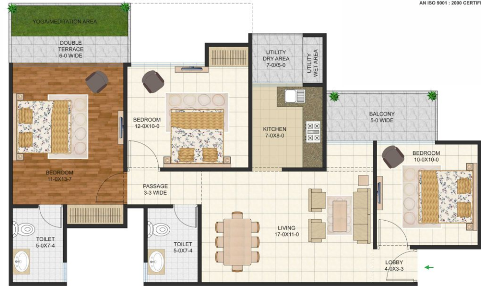
3 BHK DOUBLE HEIGHT TERRACE HOMES