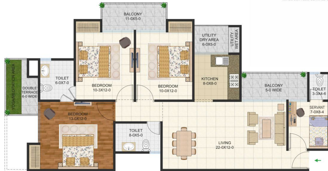
3 BHK + SERVANT DOUBLE HEIGHT TERRACE HOMES