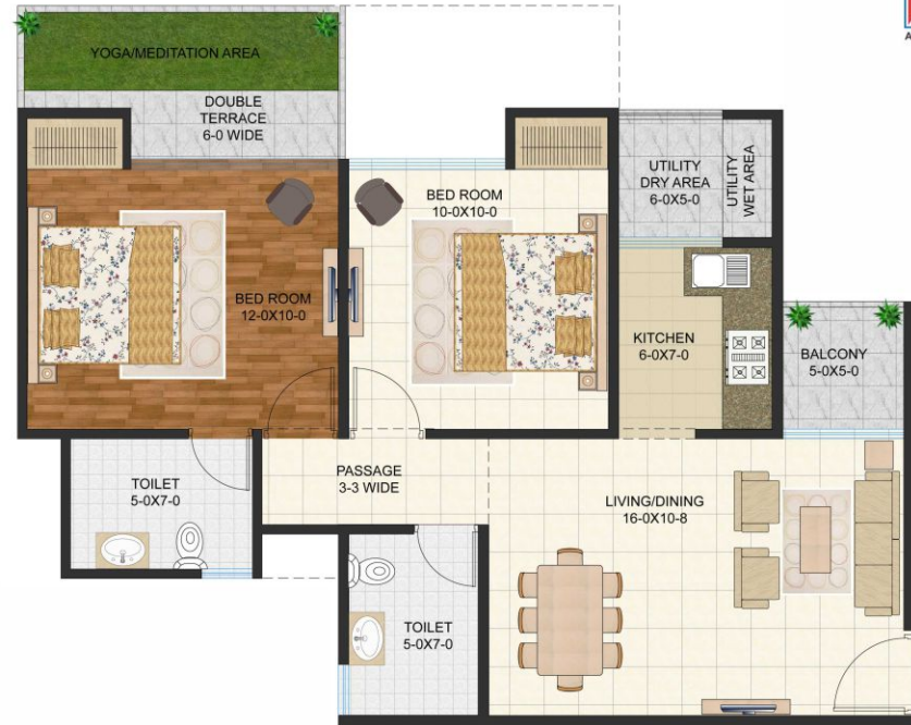
2 BHK DOUBLE HEIGHT TERRACE HOMES