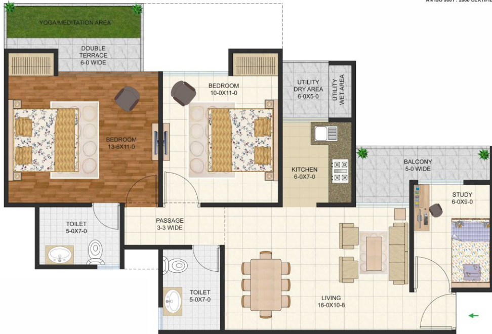
2 BHK + STUDY DOUBLE HEIGHT TERRACE HOMES