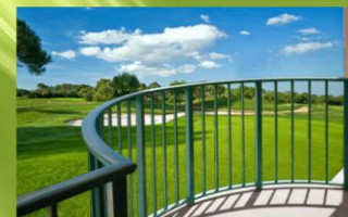
Double height terrace with grand view