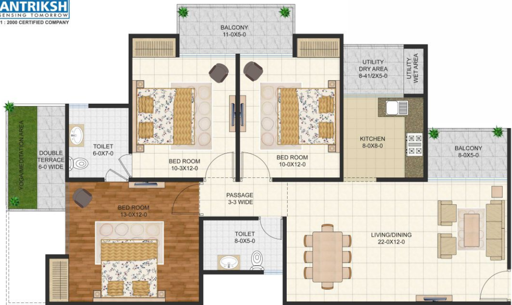
3 BHK DOUBLE HEIGHT TERRACE HOMES