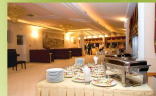
Community hall for family functions