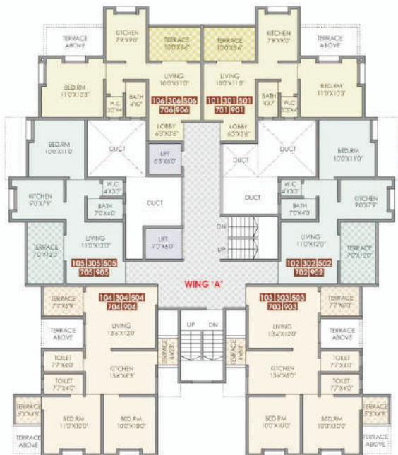
1st, 3rd, 5th, 7th & 9th FLOOR PLAN