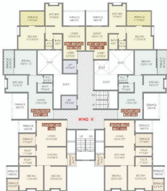
2nd, 4th, 6th, 8th & 10th FLOOR PLAN