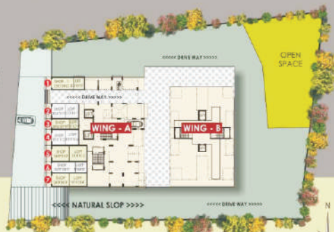
GROUND/PARKING FLOOR PLAN