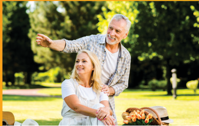
Senior Citizen Park