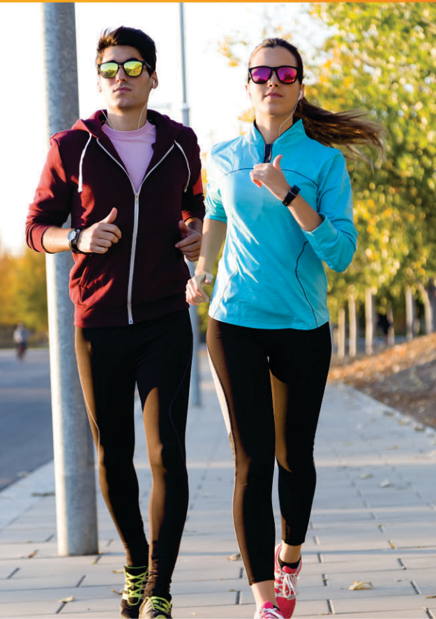
Jogging and Walking Track