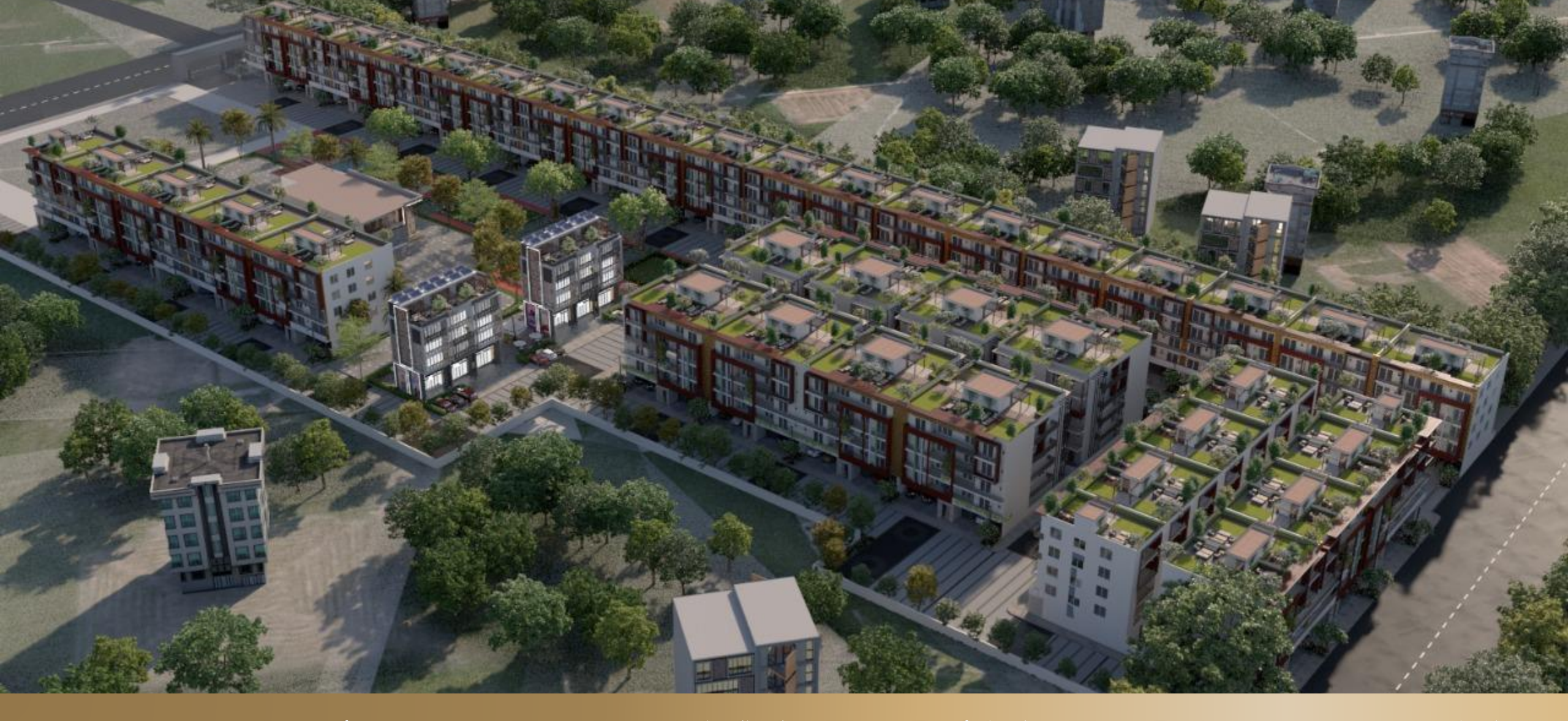
WELL-PLANNED PLOTTED GATED COMMUNITY WITH UNMATCHED ADVANTAGES