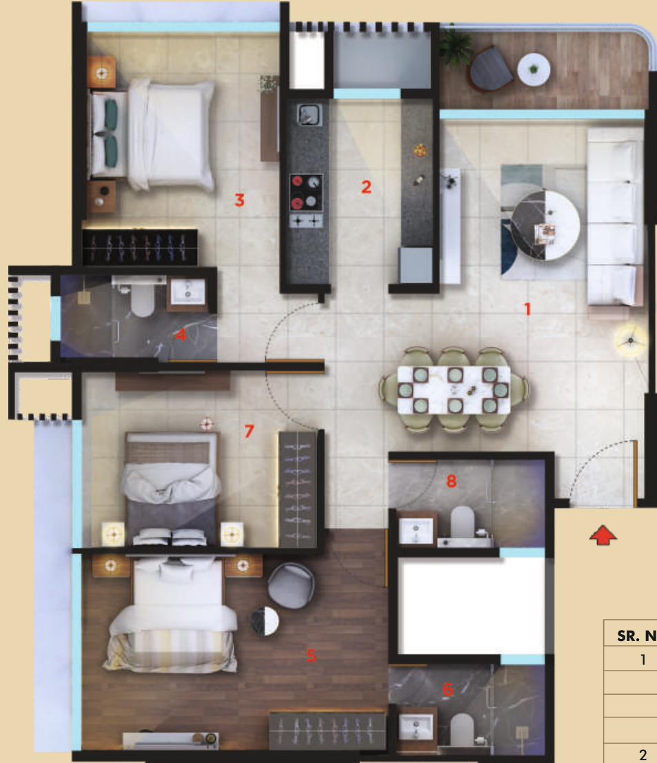
WING B - FLAT NO. 2