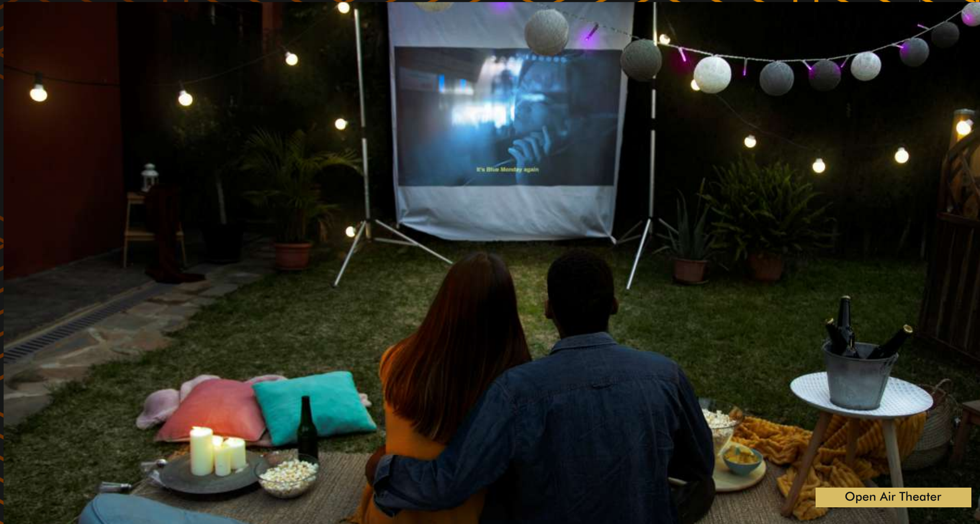
Open Air Theater