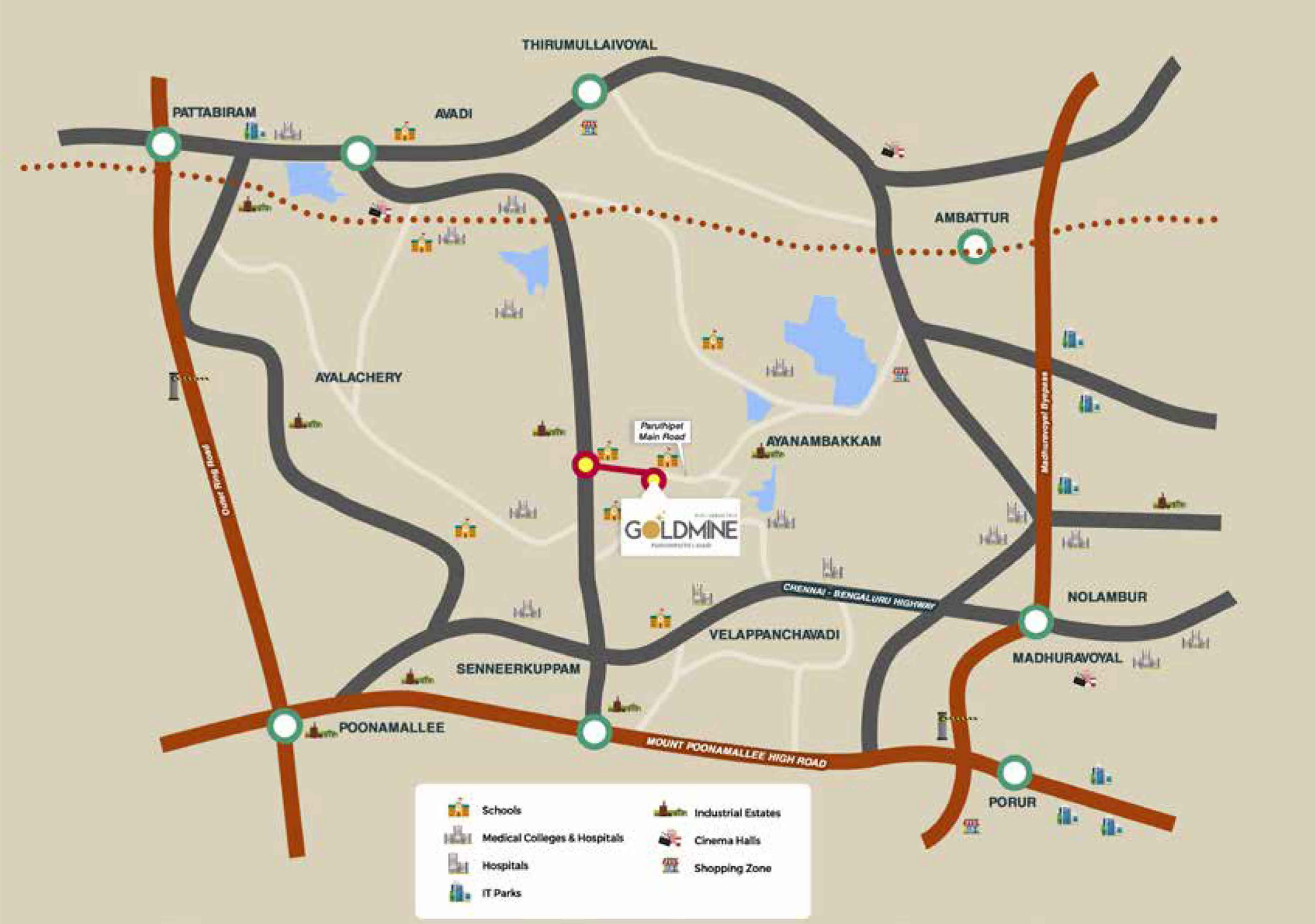
GoldMine by Urban Tree Enclave, Paruthipattu Road, (Opp. Velammal Vidhayala) Sundarasholavaram, Thiruverkadu, Chennai - 600077.