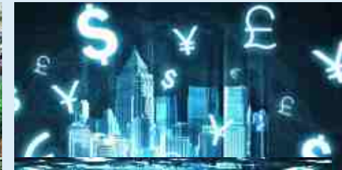
50 investment proposals worth Rs 7,000 crore from international investors

Existing upcoming projects are just a small indicator of Noida's growth potential.