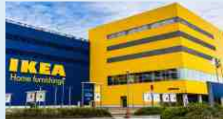
IKEA is all set to begin work of its biggest store in Noida