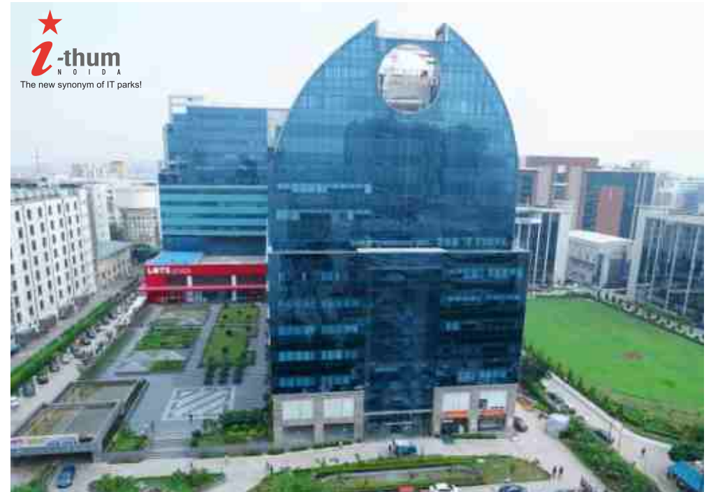
IT PARK | Sector 62, Noida