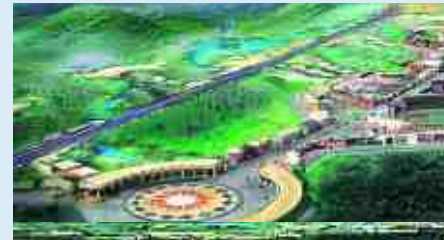
Proposed Film City