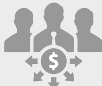
Attraction for investors