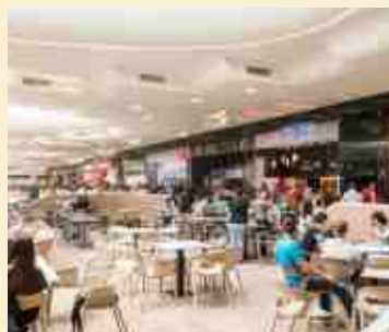
Assorted food hall

While the retail center is sure to attract a vibrant mix of high street retail, experiential stores, and luxury brands, Tastefully designed Gourmet Galleria is conceived to deliver a tantalizing experience for the entire spectrum of visitors ranging from regular eatery seekers to enthusiastic foodies and experience seekers.