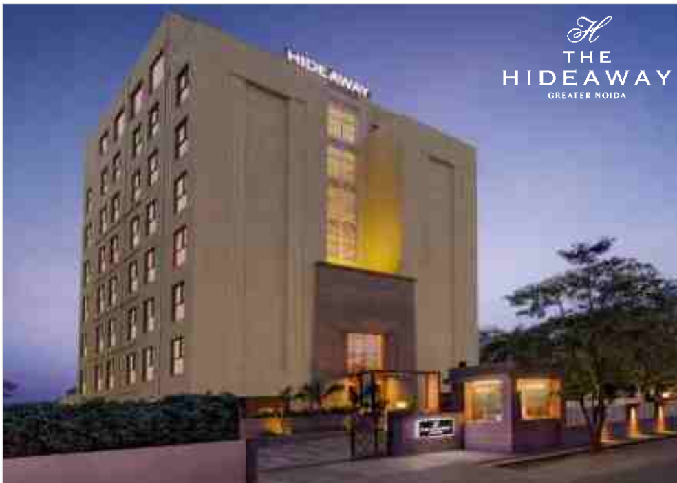
HOTEL | Knowledge Park 1, Greater Noida