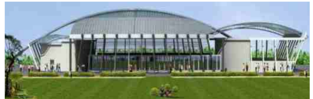
ICE SKATING RINK & INDOOR STADIUM | Dehradun , Uttarakhand