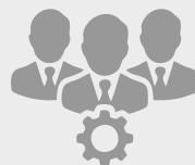
The establishment of companies