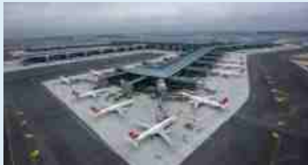
Jewar International Airport

There is no denying the fact that NOIDA is 'the investment hotspot' for the real estate sector in North India