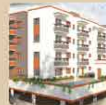
Vijaya Nisarga Off. Kanakapura Road