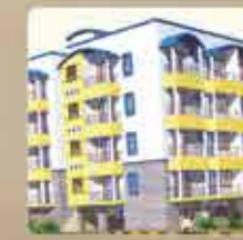
Vijaya Rhapsody Hebbal