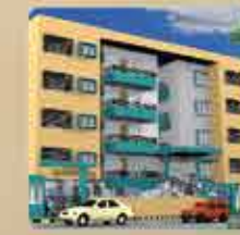
KPT Vijaya Paradise Vrshabhavathi Nagar