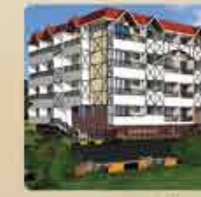
Hara Vijaya Valley View-I,II,III&IV Ittamadu