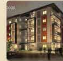
Vijaya Springwoods Begur, Off Hosur Road