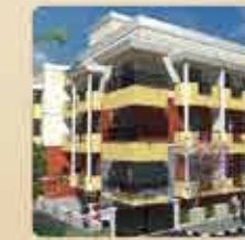
Geetanjali Residency N.R. Colony