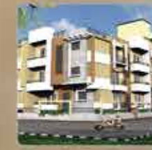
Swetha Residency N. R. Colony