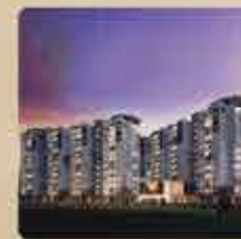
Hara Vijaya Heights Off. Kanakapura Road