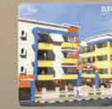
Mayura E-city Electronic City