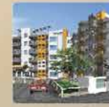
Hara Vijaya Valley View-V Ittamadu