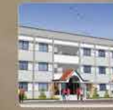
Vidyarathi Nilaya Bellary