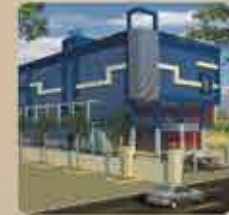
Commercial Complex Cottonpet