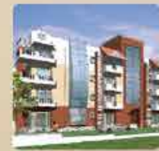
Hara Homes Bsk 3rd Stage