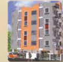
KPT Vijaya Harmony Shampura Main Road off. RT Nagar