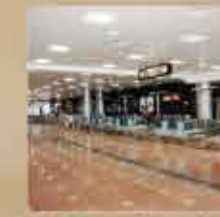
HAL Airport Bangalore