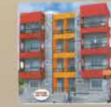
Real Home Stylish Apt Anjanapura