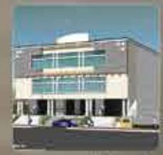
Commercial Complex Hospet. And more projects