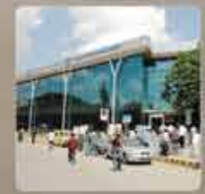
HAL Airport Bangalore