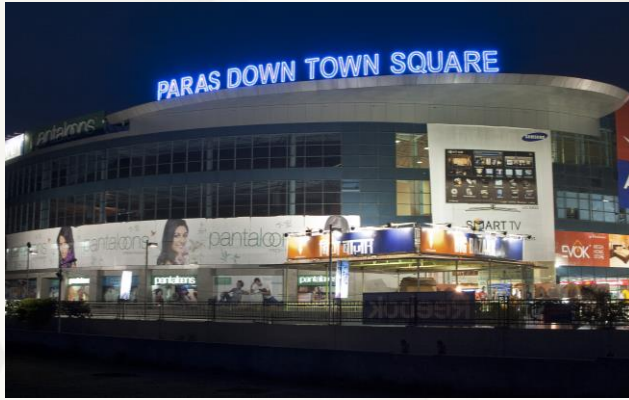
PARAS DOWNTOWN SQUARE