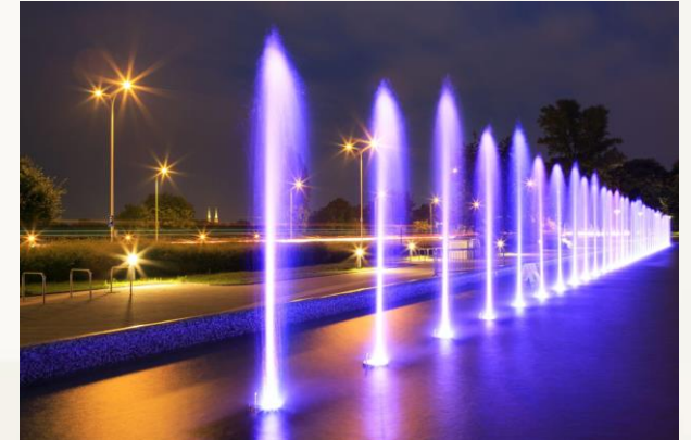
INTERACTIVE FOUNTAIN WITH LIGHTS