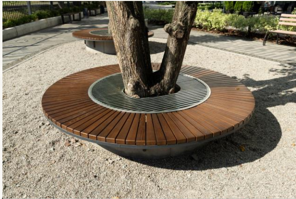
TREE SEAT WALLS