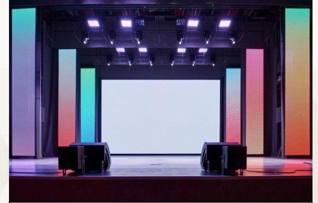
STAGE WITH LED SCREEN