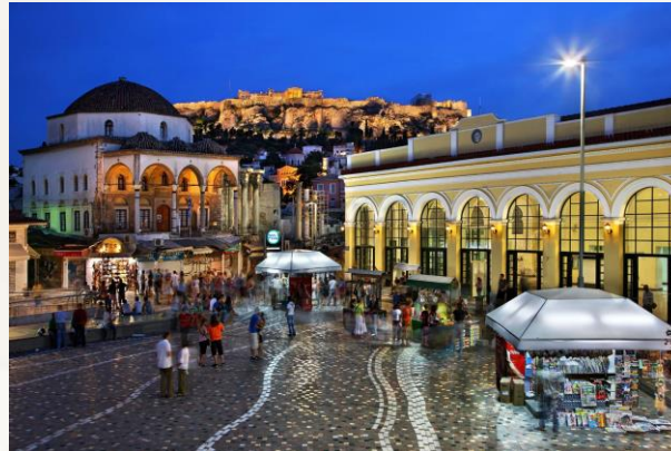
FLEA MARKET KIOSKS