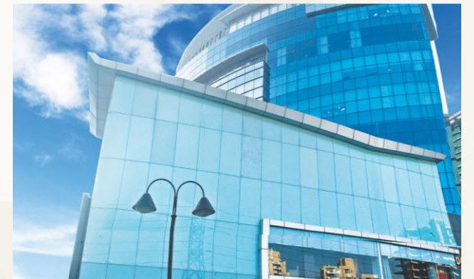
PARAS DOWNTOWN CENTER