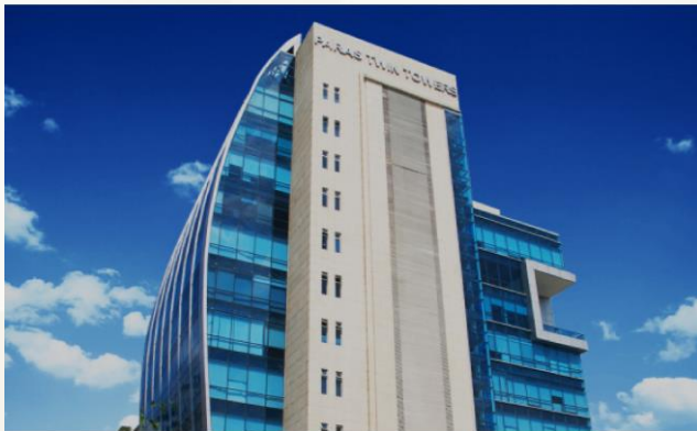
PARAS TWIN TOWERS