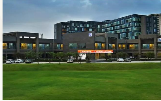
PARAS TRADE CENTRE