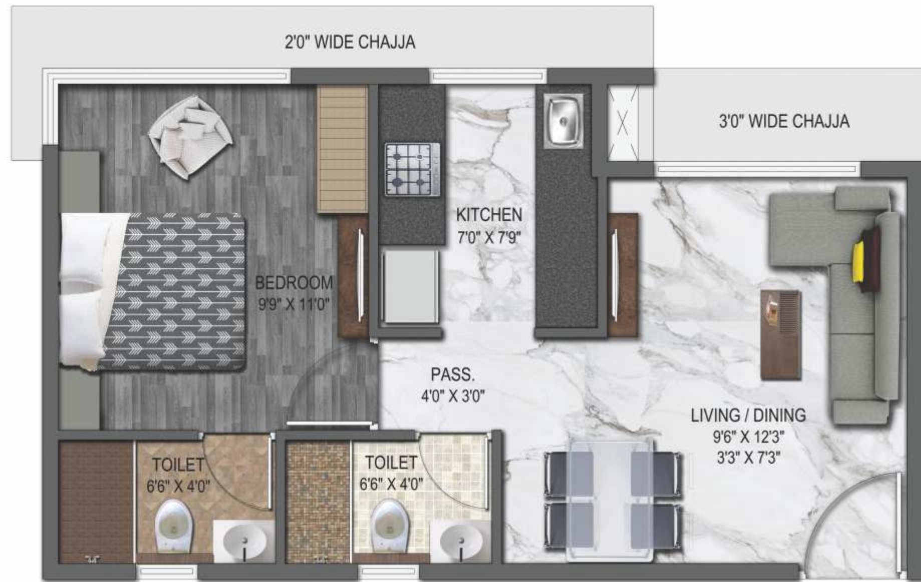
1 BHK UNIT PLAN (C.A = 369 SQ. FT.)