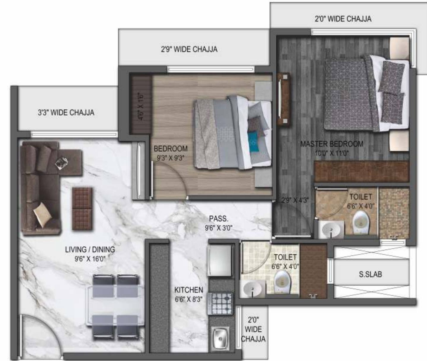
2 BHK UNIT PLAN (C.A = 500 SQ. FT.)