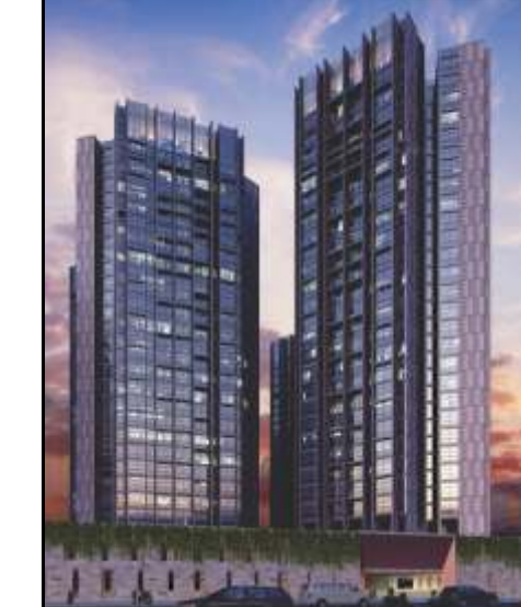
BOULEVARD Andheri (East)