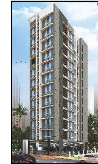
UK AUGUSTUS Santacruz (East)