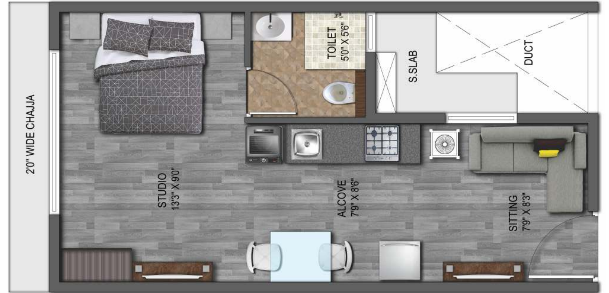
STUDIO UNIT PLAN (C.A = 277 SQ. FT.)