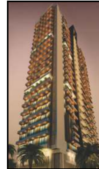
UK HEIGHTS Andheri (West)