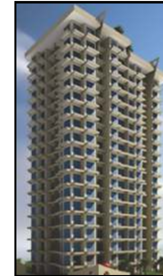
UK VEDIC HEIGHTS Kandivali (East)