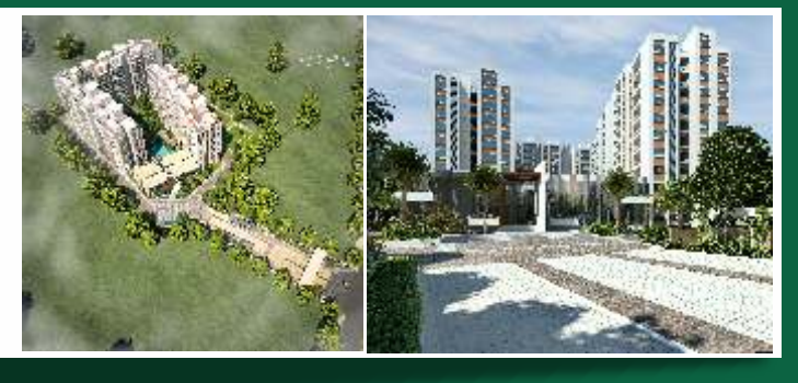
SLV NAKSHTRA @ Horamavu

With our current offering SLV Castle Mine bringing it with quality enabling life style which is