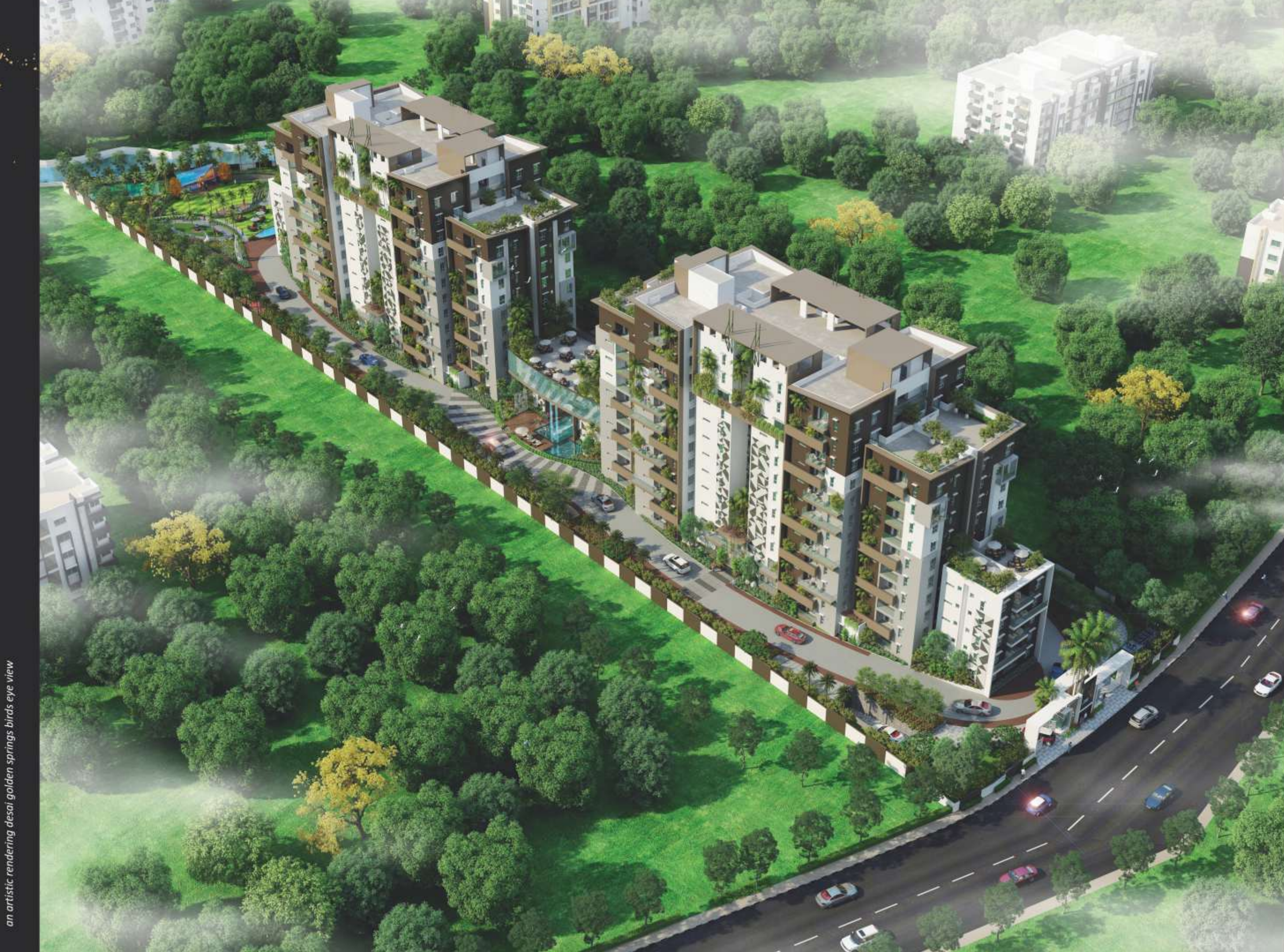
an artistic rendering desai golden springs birds eye view