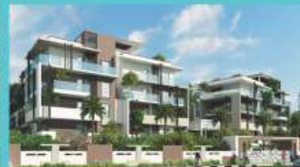
DESAI'S GRANDEUR @ whitefield