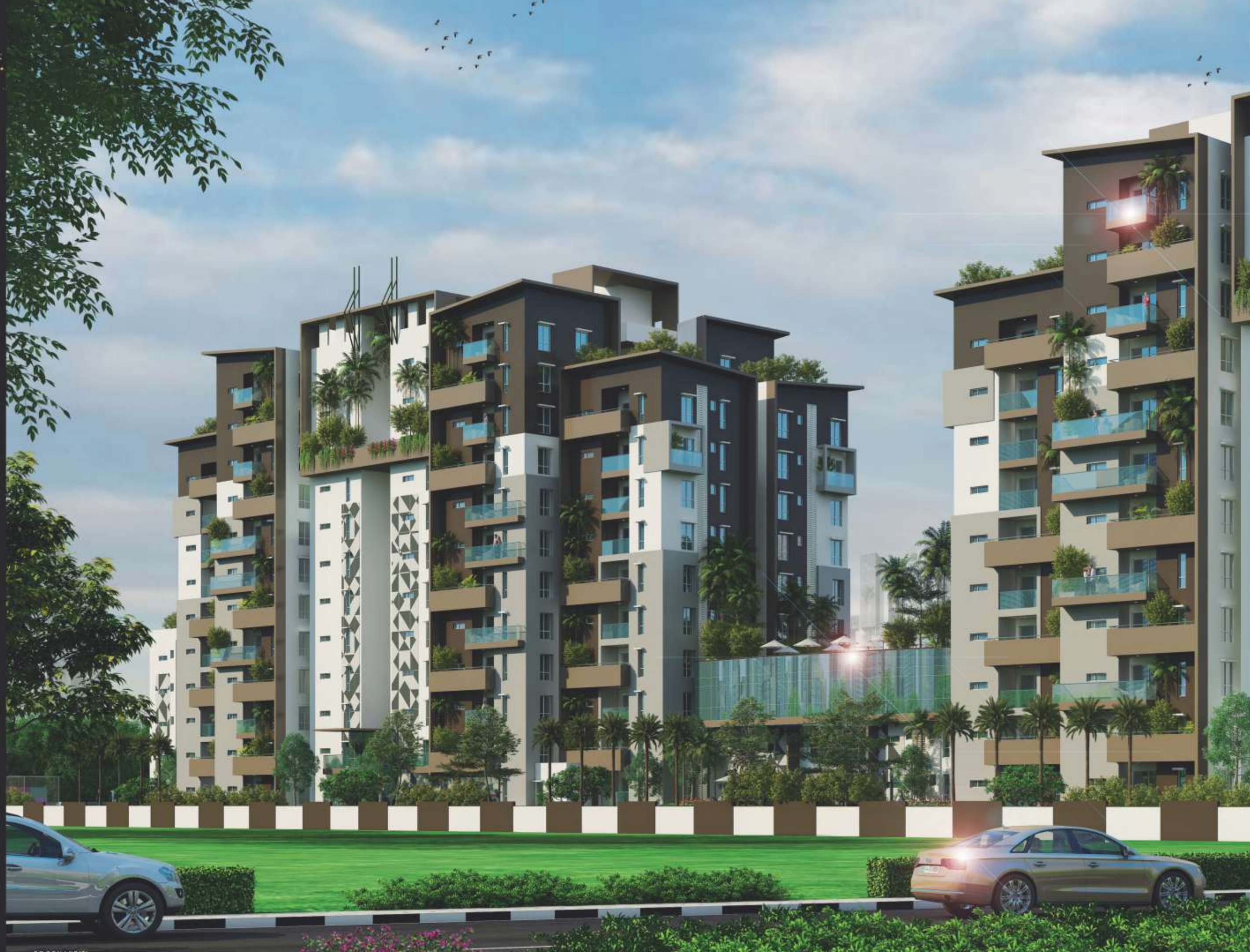
an artistic rendering desai golden springs elevation street view