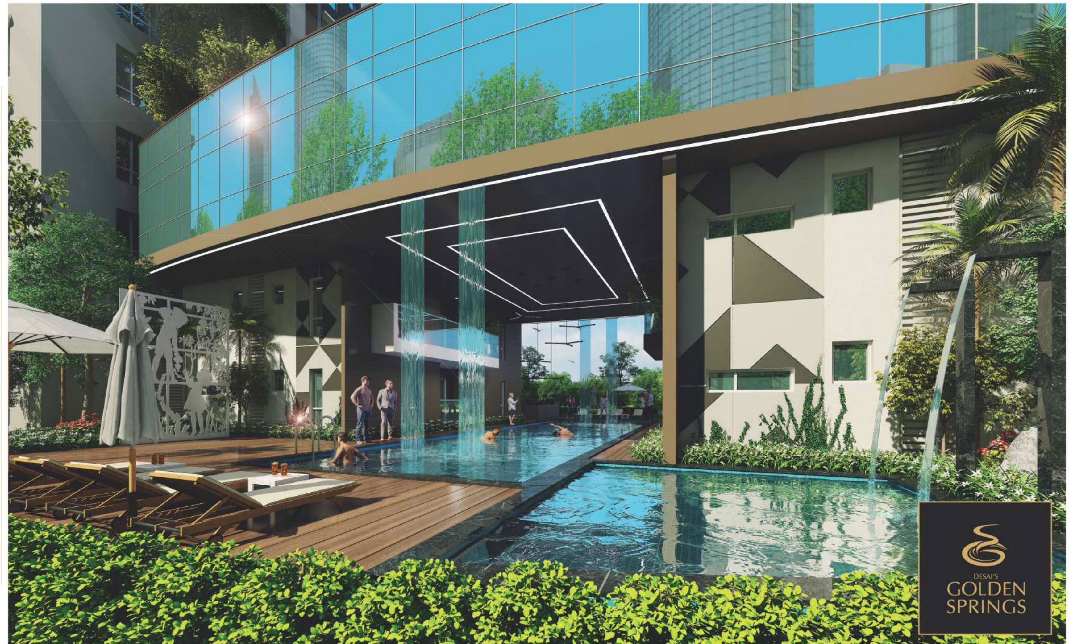
an artistic rendering desai golden springs swimming pool view