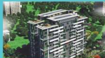
DESAI'S RADIANT @ whitefield