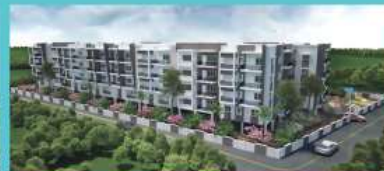
DESAI'S ORCHID @ whitefield