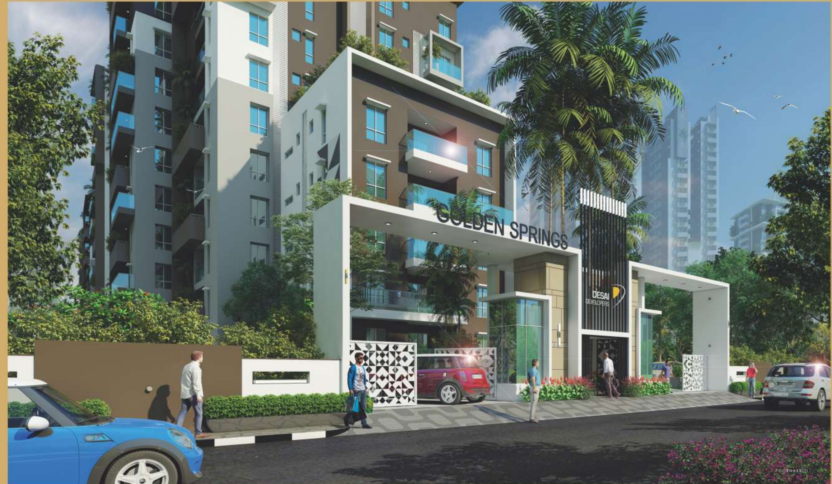
an artistic rendering desai golden springs entrance gate