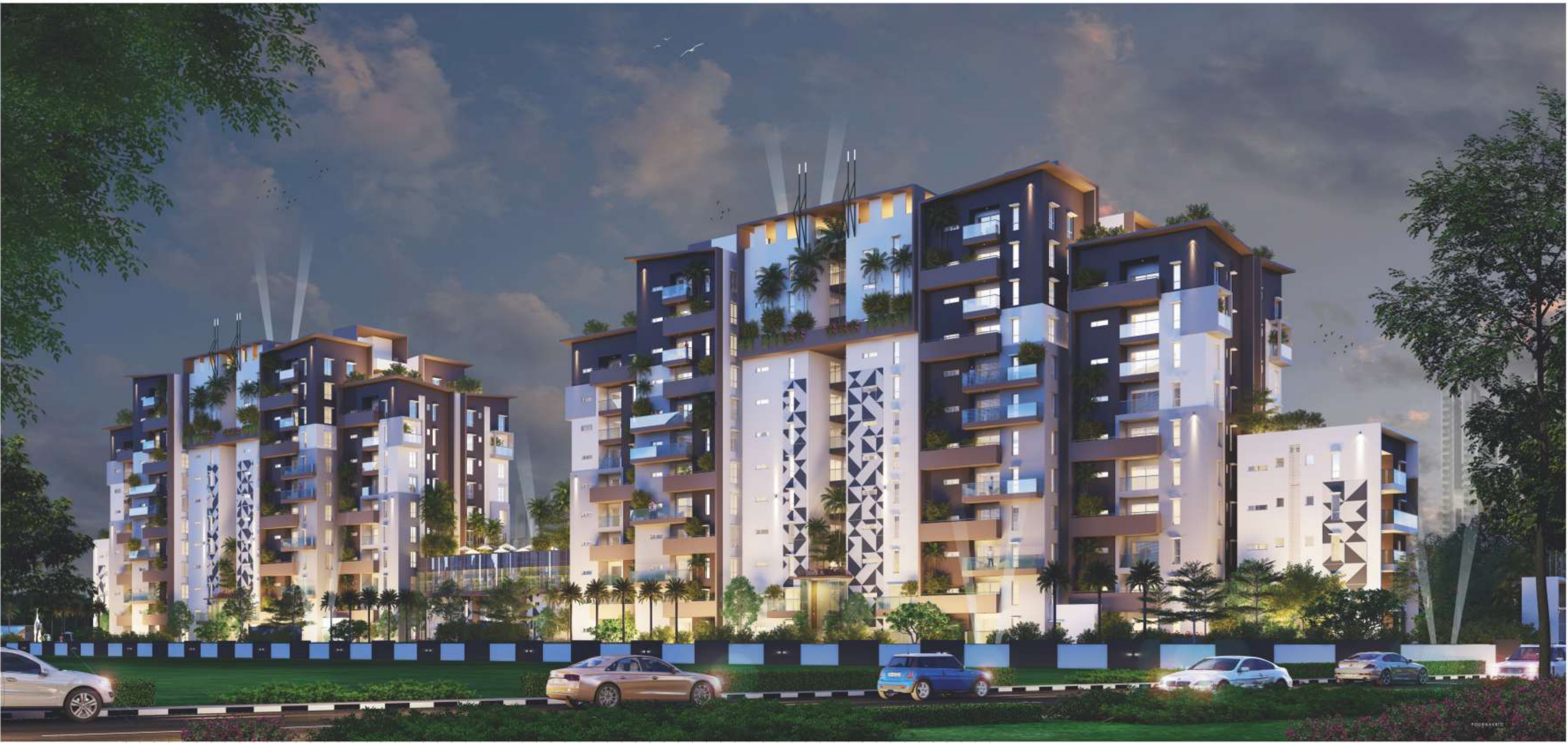
an artistic rendering desai golden springs night elevation view