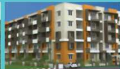
DESAI'S BEAU MONDE @ whitefield