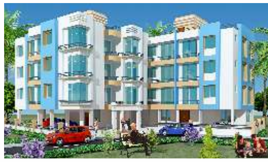
Survey No. 145 & 170, Vichumbe, New Panvel (E)