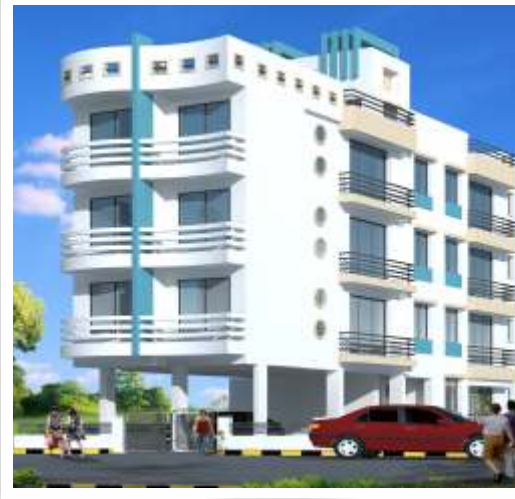
Survey No. 142, Vichumbe, New Panvel