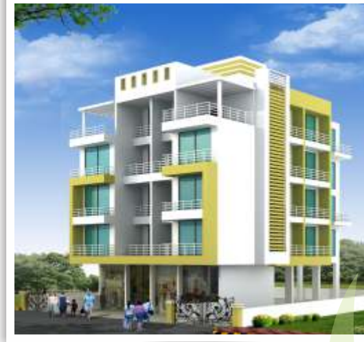
Muktai Nagar, Pen