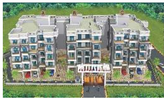
Survey No. 364/B Pen Khopoli Road, Opp. RTO Office