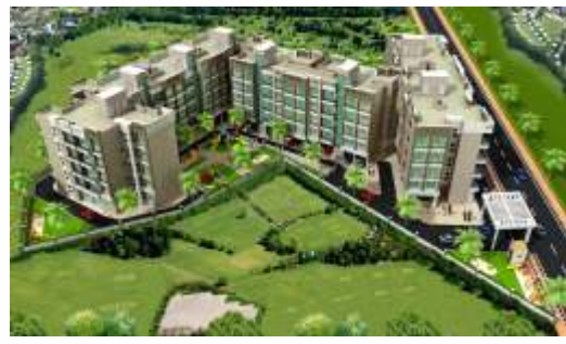
Survey No.142/2 Adai, New Panvel (E)