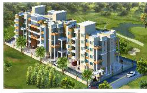
Survey No. 19/1A(1), Vichumbe, New Panvel (E)