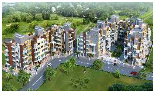
Survey No. 27/1B(2) Adai, New Panvel(E)