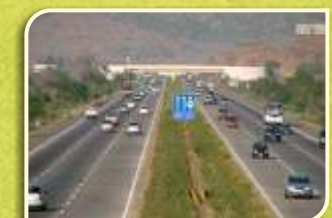
Mumbai -Pune Highway