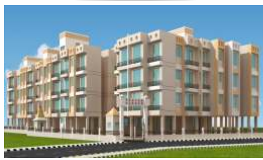
Survey No. 40/0, Sukapur, New Panvel(E)