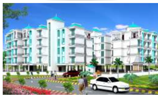
Survey No. 33, Devad, New Panvel (E)