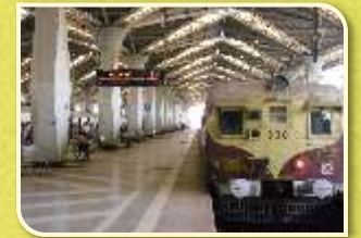
Karjat Railway Station