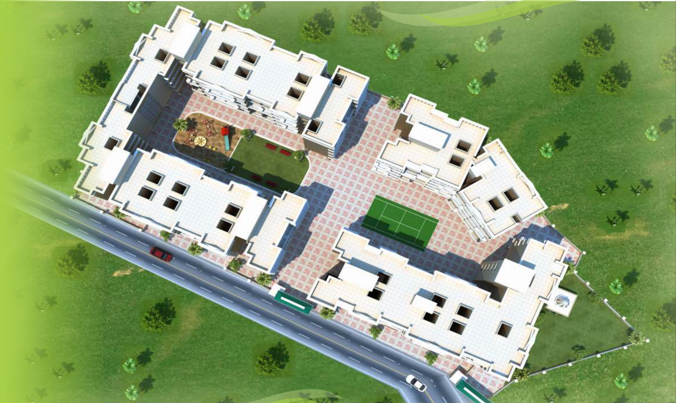
Top View - Garden & Play Area