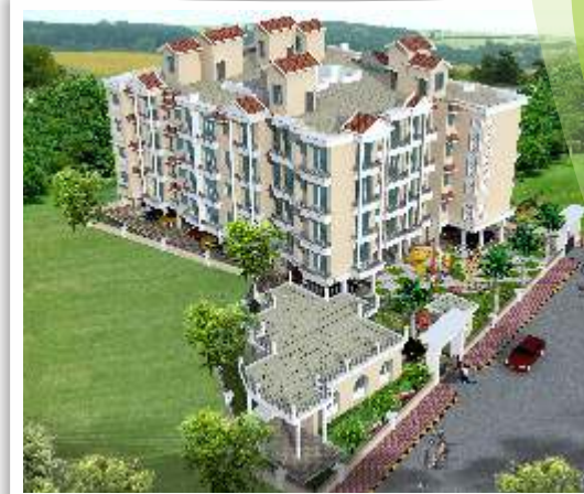
Survey No. 123, Vichumbe, New Panvel