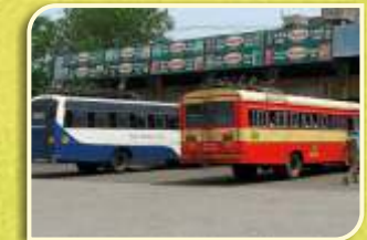
Karjat St Stand