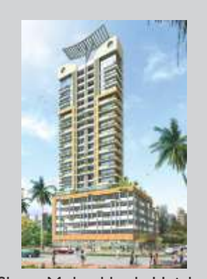
Shree Mohankheda Heights Ghodapdeo - Mazgaon